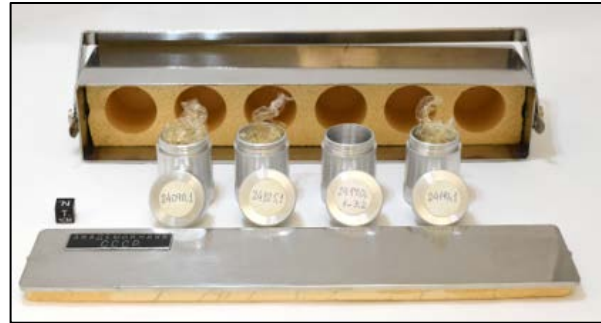
Figure 1: The original containers of the Luna 24 samples (box and sample containers) gifted to the Royal Society by the Soviet Academy of Sciences.

samples from depths of 90, 125, 170 and 196 cm in the Luna 24 core, each weighing ~0.3 g (Fig. 1) [6].