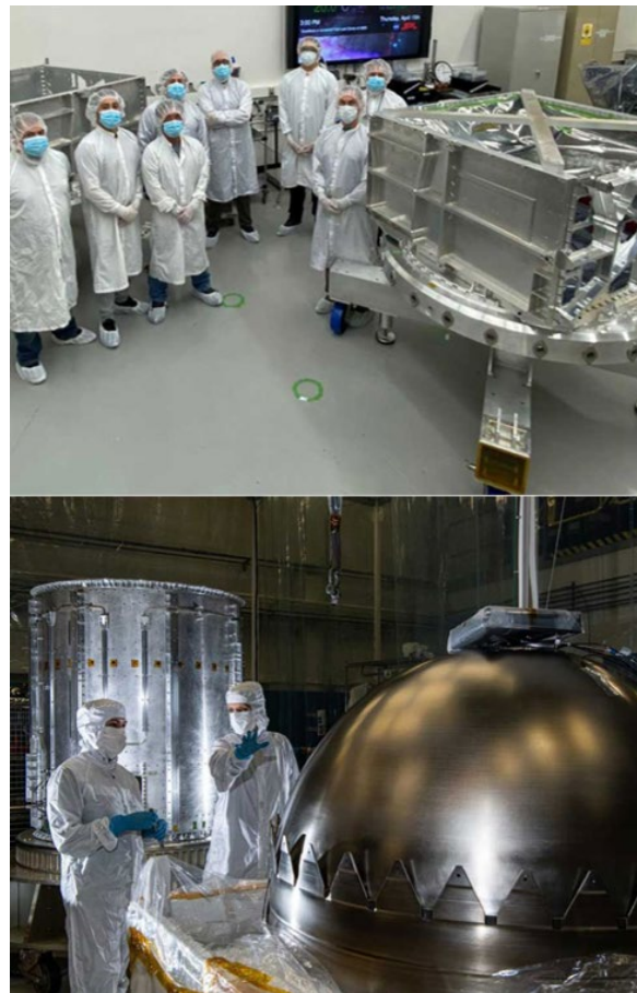
Figure 2 | Spacecraft flight hardware. Top: Engineers and technicians in a clean room at NASA's Jet Propulsion Laboratory display the thick-walled aluminum vault they helped build for the Europa Clipper spacecraft. The vault will protect the spacecraft's electronics from Jupiter's intense radiation. In the background is a duplicate vault. Bottom: Engineers at NASA's Goddard Space Flight Center in Greenbelt, Maryland, prepare for a propellant tank to be inserted into the cylinder in the background at left. The cylinder is one of two that make up Europa Clipper's propulsion module.

The Voyager and Galileo missions first revealed a deformed surface at Europa with an average surface age younger than Earth's, dominated by water ice and renewed through recent or active geologic activity. The Galileo mission discovered Europa's induced magnetic field, which indicates the presence of a global, electrically conductive fluid layer beneath the surface, most likely a saltwater ocean. Recent observations also suggest the presence of plumes that may spew internal water into space, indicating the potential for additional shallow water reservoirs beneath Europa's icy surface.