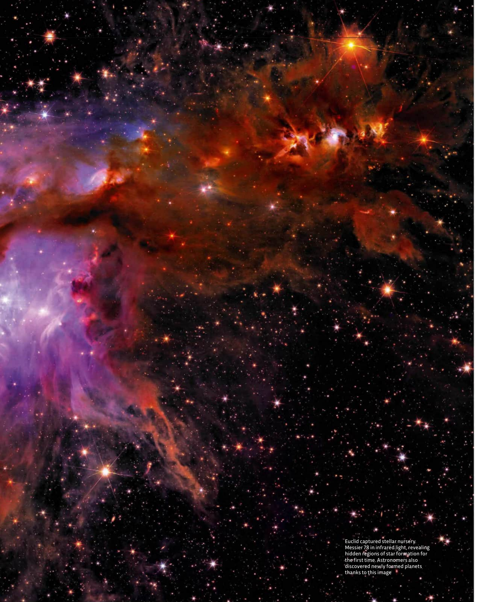
Euclid captured stellar nursery Messier 78 in infrared light, revealing hidden regions of star formation for the first time. Astronomers also discovered newly formed planets thanks to this image