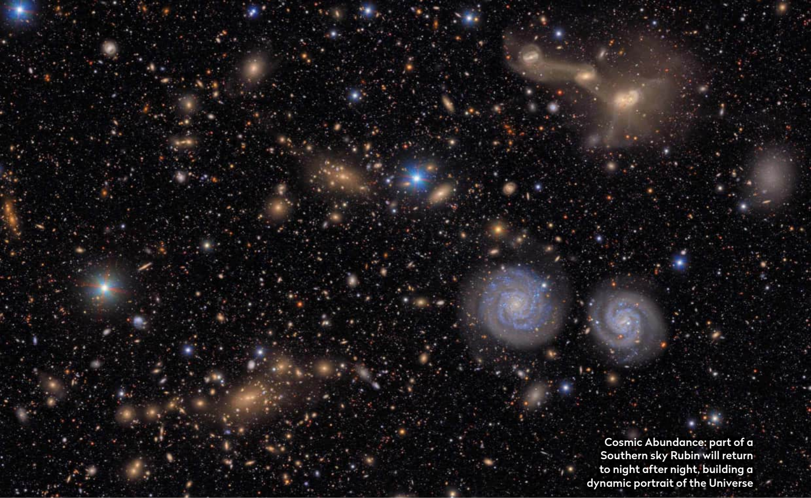
Cosmic Abundance: part of a Southern sky Rubin will return to night after night, building a dynamic portrait of the Universe