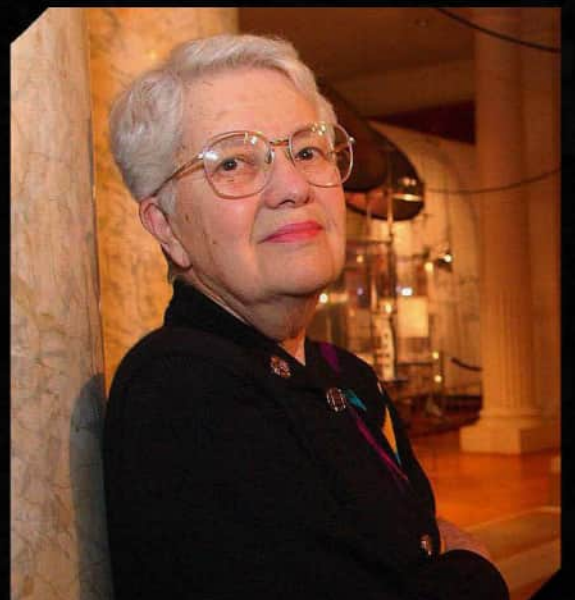
► Vera Rubin, whose work offered early evidence for dark matter, lends her name to the observatory