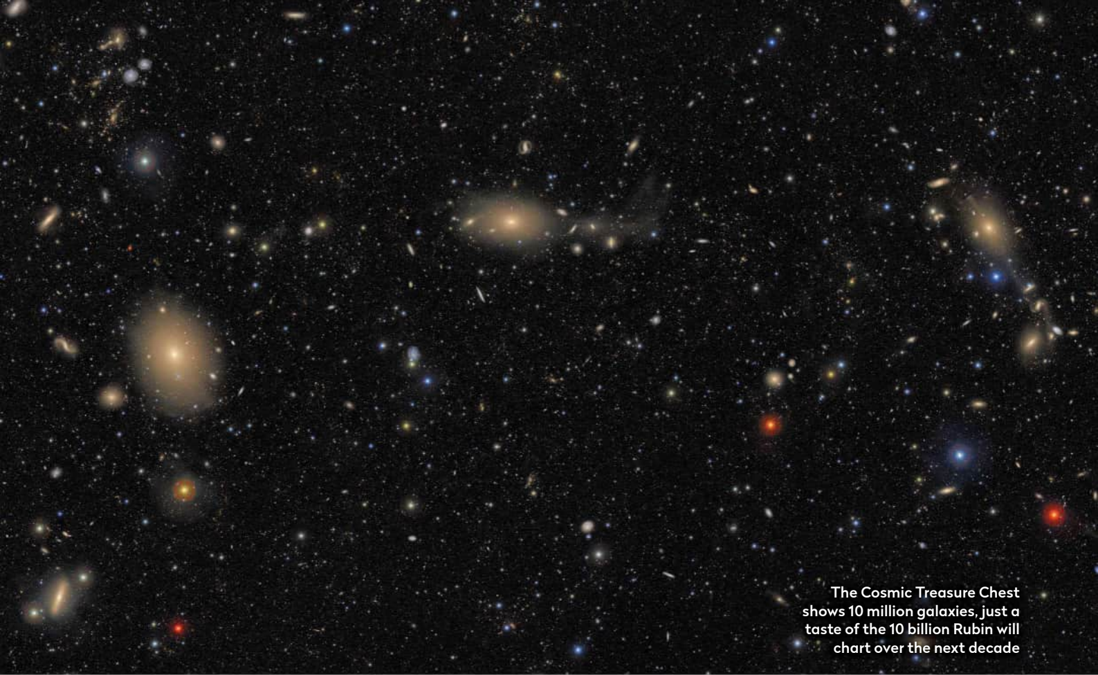
The Cosmic Treasure Chest shows 10 million galaxies, just a taste of the 10 billion Rubin will chart over the next decade

► The camera's first images, released in June, were a preview of what to expect from the decade-long LSST survey. One, a widefield view of the southern Virgo Cluster called the Cosmic Treasure Chest, looked deeply into just a small percentage of what Rubin can see. It revealed a startling level of clarity, with around 10 million galaxies springing forth in rich detail.