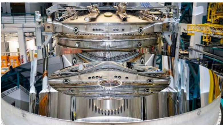
▲ The primary mirror, pictured in the on-site silver-coating chamber

◀ The telescope is designed for speed and precision, capturing around 1,000 images a night and scanning the entire Southern sky every three nights