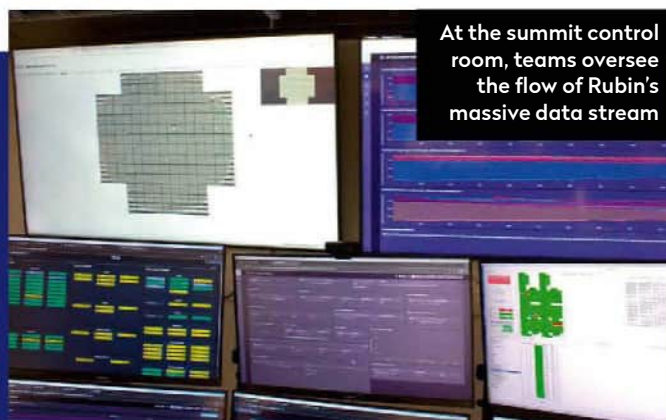
At the summit control room, teams oversee the flow of Rubin's massive data stream