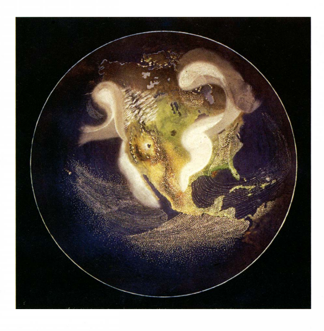
Fig. I. Weather systems over North America as they might appear from a satellite 4,000 miles above Amarillo, Texas, on June 21. The painting was commissioned by Dr. Harry Wexler, director of meteorological research, U.S. Weather Bureau. Surface features are drawn taking into account Earth's normal colors, reflectivity of sunlight, and scattering and depleting effects of light passing through the atmosphere, with calculated brightness of various cloud types. Weather features include a family of three cyclonic storms extending southwest from Hudson Bay

he Harry Wexler Papers in the Library of Congress contain a copy of Aviation Week for 3 February 1958 with a black-and-white image on the cover depicting how the Earth and its weather systems might appear as transmitted by television from a satellite vehicle. I had seen the magazine in the library of the National Air and Space Museum and had also found black-andwhite glossy prints of the image many times in various collections-in one case, with the intriguing caption, "taken from an original color image." I had looked for the color image, to no avail, in the National Archives, NOAA Cen-