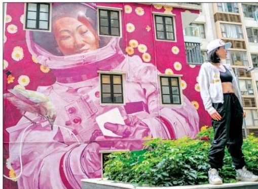
A giant mural created by the German art collective Innerfields is seen in Central on Thursday. The work is a part of HKwalls 2023, a nine-day festival running through Sunday, which is dedicated to promoting street art. Last held in May 2021 in the Sai Kung district, HKwalls focuses on the Central and Western district this year.