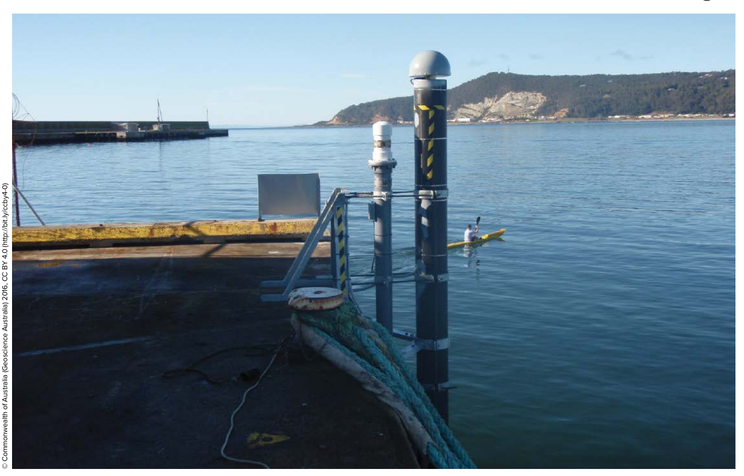
An acoustic tide gauge monitors the harbor at Burnie on the northern coast of Tasmania, Australia. To its right, a special pillar has a GNSS receiver on top.

any types of geophysical and environmental studies rely on accurate measurements of sea and land levels and knowledge of how they vary between locations and over time. Sea levels, however, can be particularly complicated to measure.