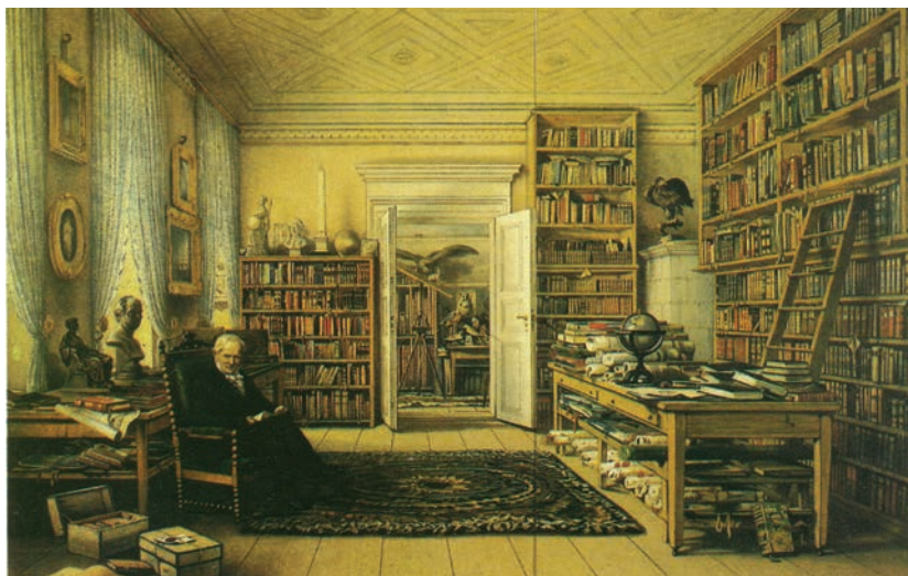
Humboldt sits in the library of his Berlin apartment in this mid-19th-century painting by Eduard Hildebrandt.