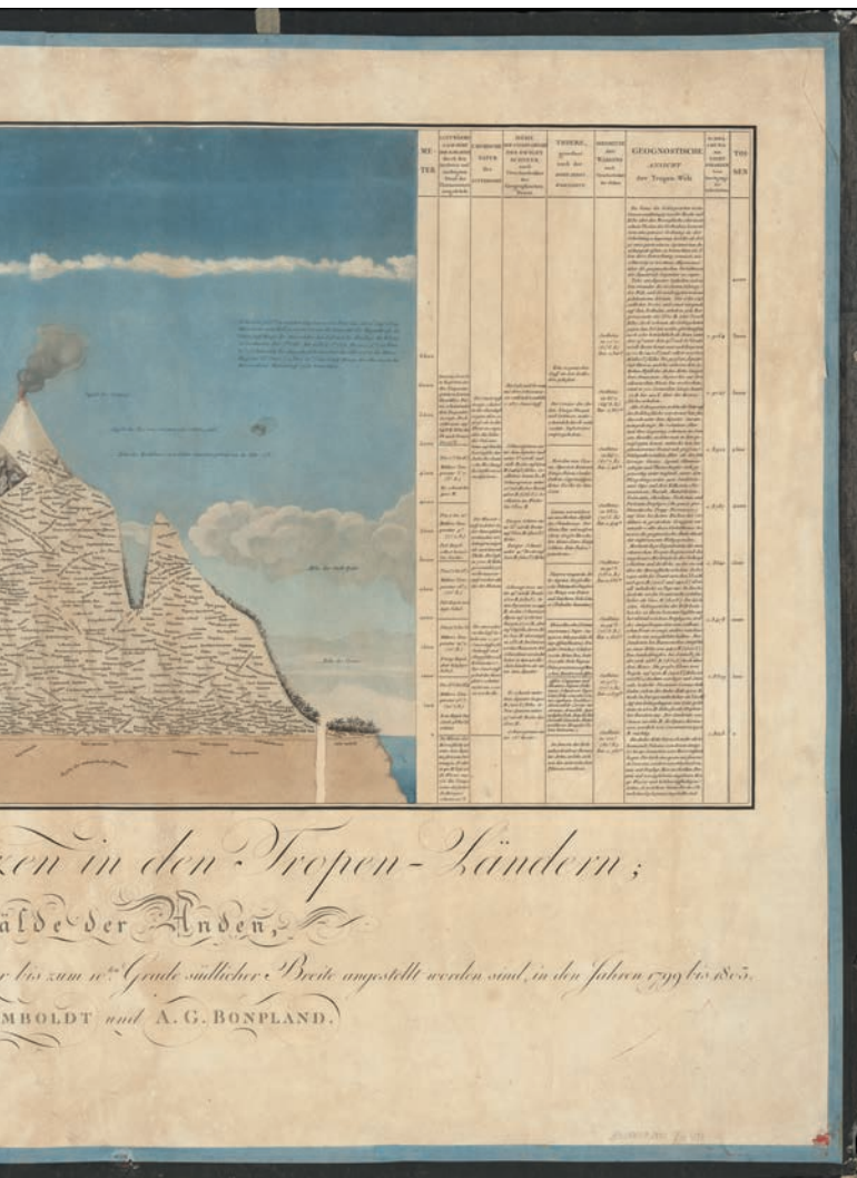
Parícuti and Cotopaxi volcanoes (in present-day Ecuador) with detailed information about plant life from the pair's "Essay on the Geography of Plants," originally published in French in 1807. See a larger version at https://www.eos.org/story/52811/ .