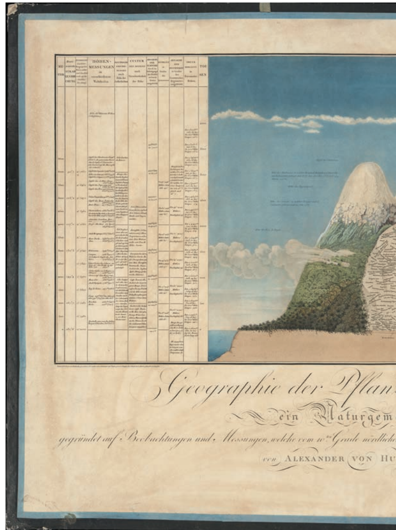
Humboldt and his colleague Aimé Bonpland annotated this cross-sectional illustration of Chimborazo geography based on observations from their travels in South America. The figure accompanied the first version at Eos.org.

After his return to Europe, Humboldt spent much of the rest of his life placing the findings from his Latin American voyage into a global environmental context.