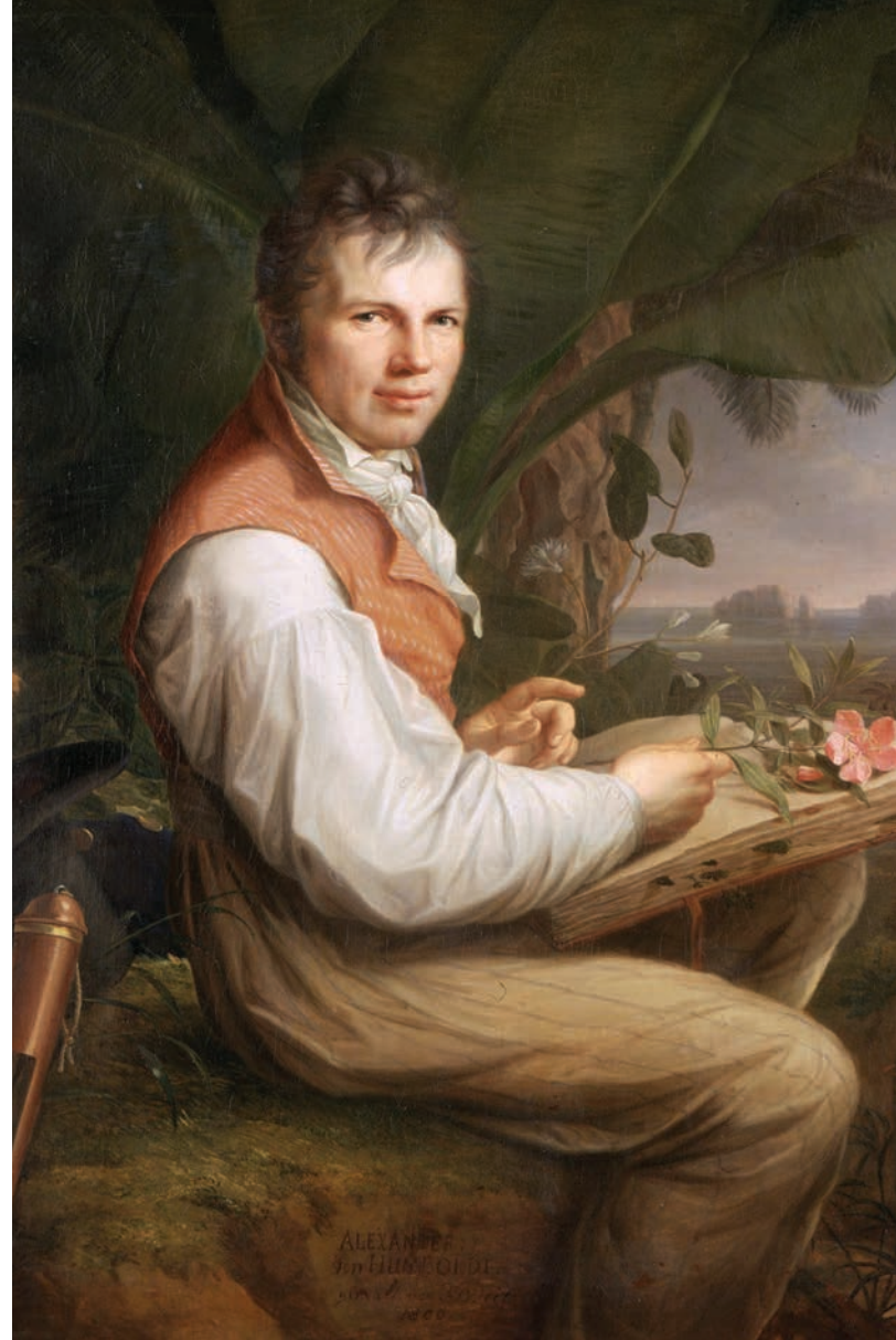
This painting depicts Humboldt studying Alstroemeria flowers on his groundbreaking voyage to South America near the banks of the Orinoco River in Venezuela.

This year, 14 September marked Humboldt's 250th birthday, offering an opportunity to revisit and celebrate his life and contributions to science. AGU is commemorating Humboldt with a new theme in Geochemistry , Geophysics , Geosystems , as well as with a Union session at the Centennial Fall Meeting in San Francisco next month ( bit.ly/AGU-FM-Humboldt ).