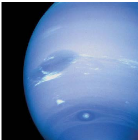
Uranus (left) and Neptune's dark spot and bright streaks (right) imaged by NASA's Voyager 2 in 1986. Planets are not to scale.

how and why that happens are not clear," he said.