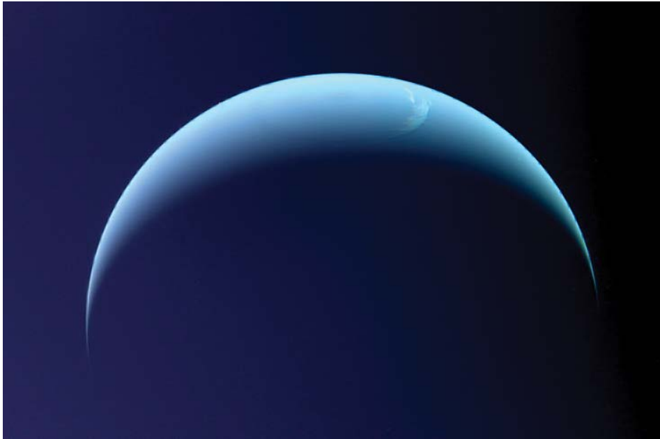
NASA's Voyager 2 snapped this picture of a crescent Neptune on 31 August 1989 during the spacecraft's flyby of the planet. Voyager 2 is the only mission to have visited Uranus or Neptune.

Launching a small orbiter with an accompanying atmospheric probe to the solar system's ice giants, Uranus and Neptune, should be a top priority for NASA in the coming decade, say planetary scientists who conducted a review of potential missions to do so. Beyond being scientifically valuable, such a mission to each planet is technologically feasible, the team said. Voyager 2 visited the ice giants in the 1980s, the only craft ever to do so.