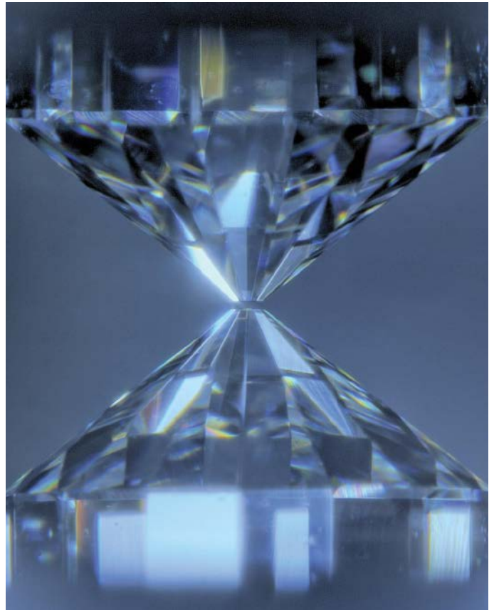
Diamonds are one of the hardest materials on Earth, and scientists can use them to compress iron to pressures inside Earth’s core.

Discerning the thermal evolution of Earth “will pose a challenge for the next 15 years for the community.”