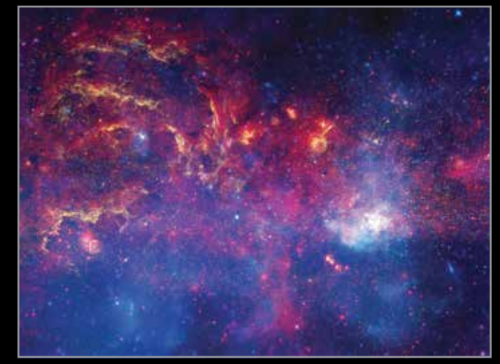
The central precincts of the Milky Way Galaxy form bright whirls, arches, and streamers in this multiwavelength image. This chaotic "downtown of the Milky Way" was sonified with piano, glockenspiels, and violins.