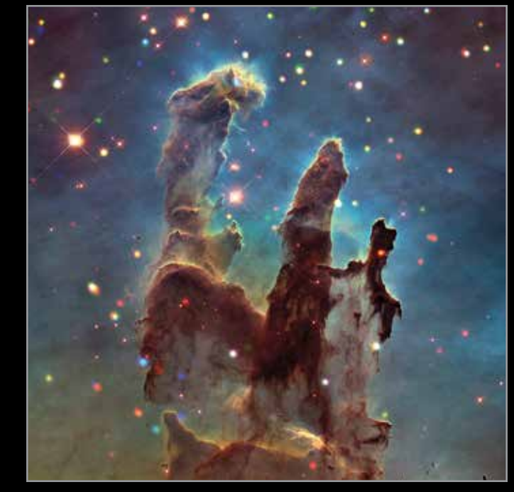
Some audifications of the Pillars of Creation, seen in this composite optical and X-ray image, have created sounds of the "young stars having tantrums." Hot young stars, captured in X-rays, shine like bulbs on a strand of Christmas lights.