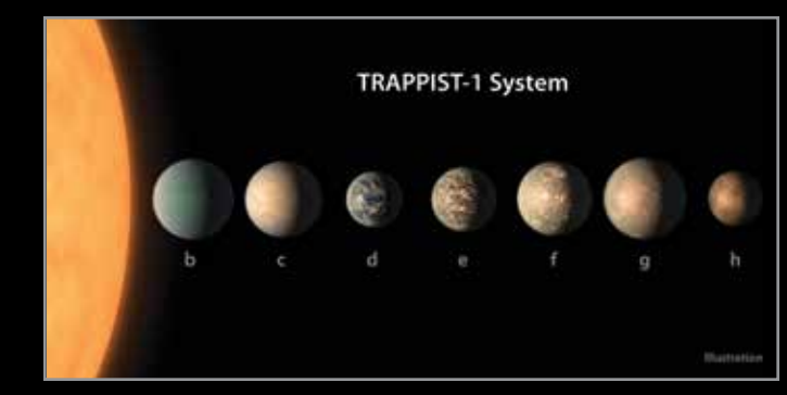
The known planets of TRAPPIST-1 line up next to their parent star in this artist's concept. A sonification uses musical notes to depict the resonances of each of the planets' orbits.