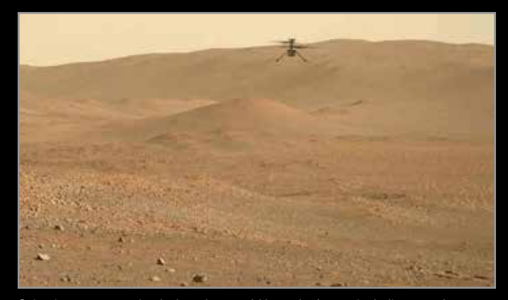
Scientists were surprised when they could hear the Ingenuity helicopter, shown here during its 54th flight in April 2023, almost a football field away from the Perseverance rover, indicating that the Martian atmosphere is better at propagating sounds than was expected.