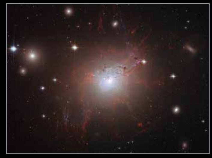
This Hubble Space Telescope image shows the giant galaxy NGC 1275, which contains a supermassive black hole in its core. Sound waves ripple through the gas around the black hole, which researchers have pitched into the range of human hearing, creating a creepy "moaning" sound. Credit: NASA, ESA, Hubble Heritage, A. Fabian (University of Cambridge, UK)

SuperCam fires laser bolts at rocks and soil, then uses a spectrometer to analyze the composition of the vaporized material. The microphone records the zaps, the sounds of which reveal the hardness of the original material, which, in turn, reveals details about its formation.