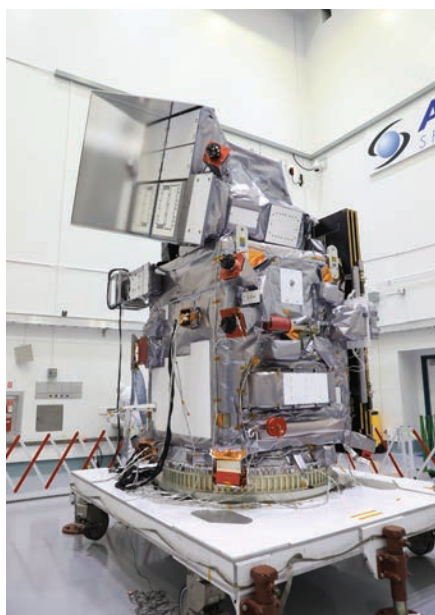
Scientists and engineers test PACE before its launch.

polarized as it passes through the atmosphere, which can indicate the amount, size, and shape of suspended particles and other properties of clouds.