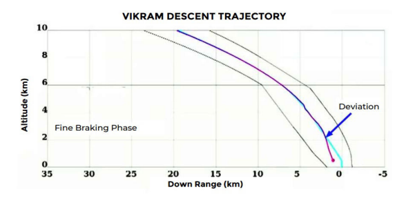
Figure 2 Vikram Lander Trajectory