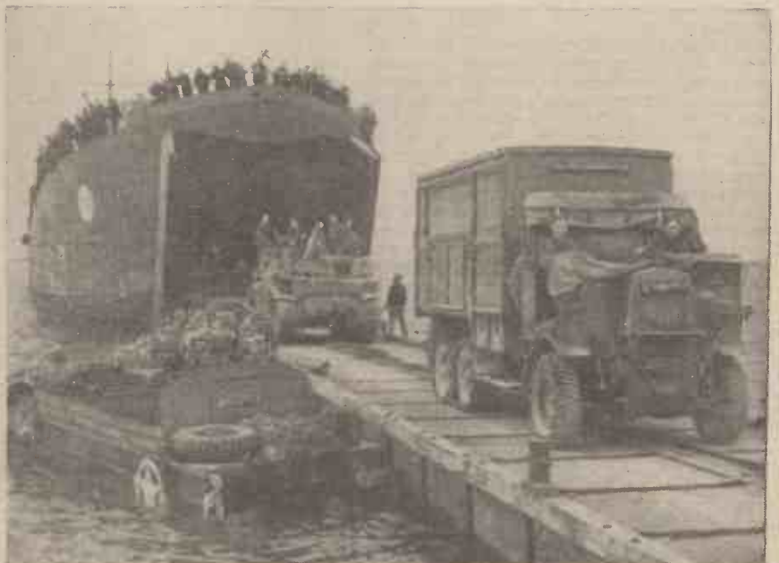
Vehicles and tanks coming ashore from a landing craft during the embarkation of British troops in Italy.

The majority of the aircraft delivered to the United Kingdom has been produced in the United States and the balance in Canada. Behind the achievement of the twenty-thousandth crossing is a story of organisation and high endeavour.