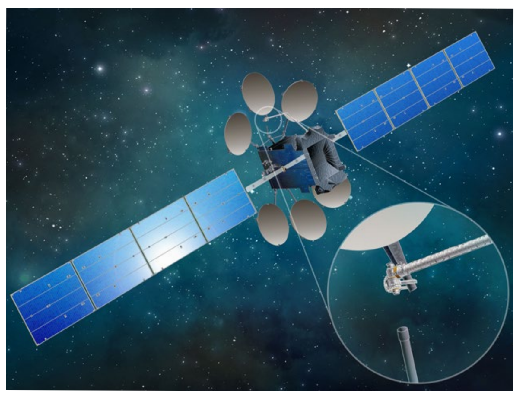
An artist's rendition of the upcoming Dragonfly mission, a collaboration between NASA and Space Systems Loral to demonstrate technologies required for orbital construction. Dragonfly's robotic arm ( inset ) will assemble and deploy reflectors to create a large radio antenna when the mission launches sometime in the 2020s.

The forces demanding supersize space telescopes are straightforward, too: The larger a scope's light-collecting mirror is, the deeper and finer its cosmic gaze. Simply