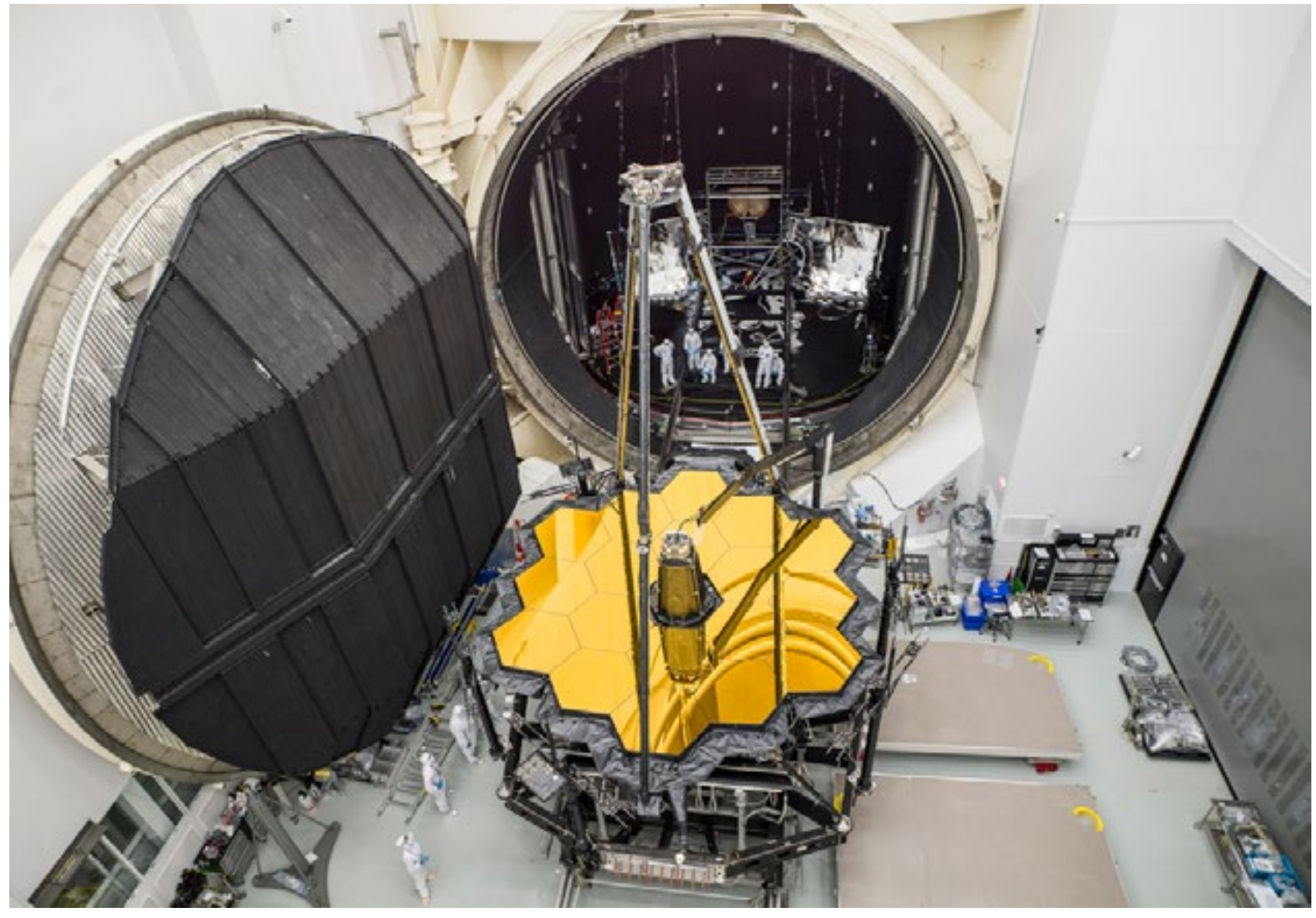
The James Webb Space Telescope's scientific instruments and optical elements-including its gold-plated 6.5-meter primary mirroremerge from cryogenic testing at NASA's Johnson Space Center in Houston on December 1, 2017.

of a foldable 6.5-meter mirror and an even larger "sun-