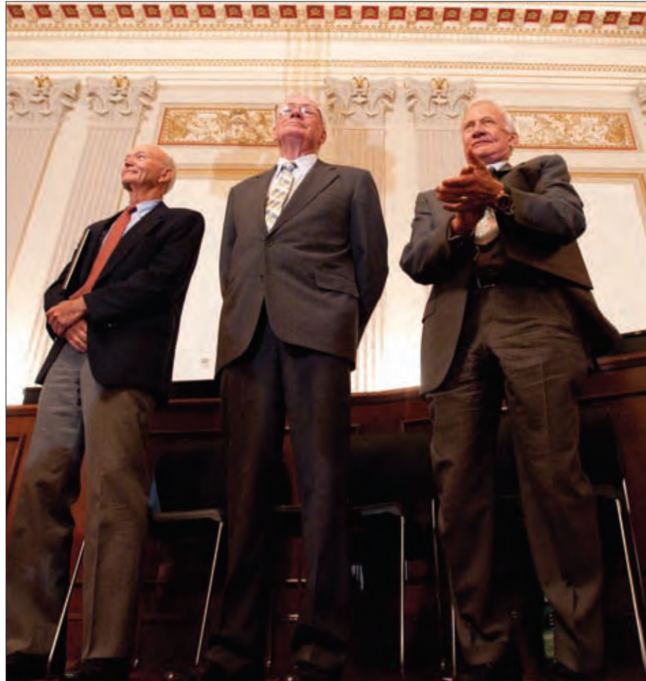
On the eve of the 40th anniversary of Apollo 11's Moon landing, crewmembers (from left) Michael Collins, Neil Armstrong, and Buzz Aldrin gathered at the National Air and Space Museum.

hundred years after Galileo presented his invention, which he used to discover Jupiter's moons, the Hubble Space Telescope received its final servicing, and on July 23 its lens turned to Jupiter, recording sharp images of the aftermath of a surface impact by a comet or asteroid.