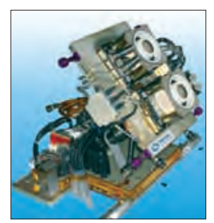
Snecma's products include this thruster module assembly.

2010. ESA's Gravity Ocean Circulation Explorer satellite was launched in March with a pair of ion thrusters manufactured by QinetiQ.