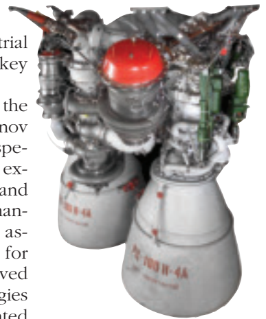
A modified RD-180 engine will serve as the first stage booster for the Rus-M family.