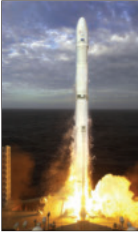
Zenit rockets are manufactured primarily in Ukraine.

space industry observers in Moscow have voiced concern that even with enough money, the rocket enterprises cannot hire enough skilled new employees to staff up for the increased efforts. Another widely acknowledged impediment to upgrades is the declining skill base of the Russian space and missile industry: More and more components, and in some cases even entire avionics and propulsion assemblies, must be purchased from foreign suppliers.