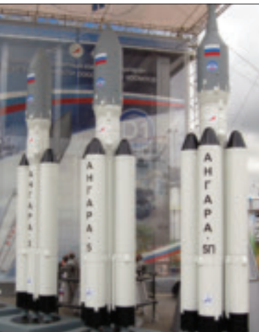
Test flights of the Angara family of small to medium-weight launch vehicles have been delayed into 2013-2014.

Detailed design work on launch support structures will allow facilities to handle