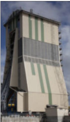
Construction is ongoing for the Soyuz launches in French Guiana.

Time will tell if the Russian space program retains the talent and the governmental support to surmount this chosen new challenge, the greatest it has faced in 50 years. Dedication and history they clearly have in abundance, along with an inspirational motto that got them through the dark days of privation immediately after the USSR’s collapse: “The difficulties ahead of us are less than those we have already overcome,” workers told each other then. But is that enough? ♣