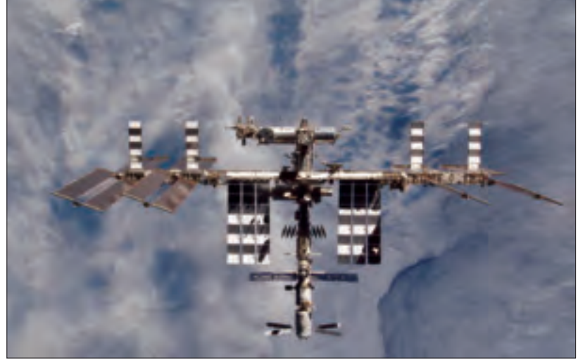
The ISS is an examplar of lessons learned for orchestrating any global program of human travel beyond LEO.

Grimard presented his personal view at the 2011 International Astronautical Congress in Cape Town, South Africa: "Today,