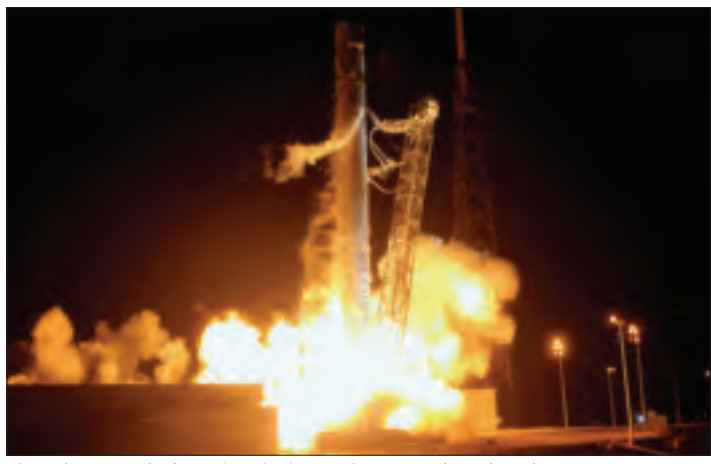
The Falcon 9 rocket's engines ignite on the SpaceX launch pad at Cape Canaveral Air Force Station on May 22.