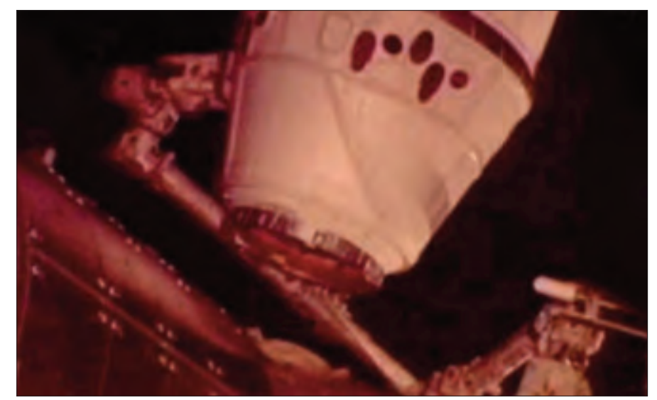
From the ISS, Dragon can be seen on May 25 as the station's robotic arm moves it into place for attachment.

Many space observers and policy specialists were skeptical that SpaceX could pull off this ambitious agenda in a single mission. Software problems had delayed the launch repeatedly and led to several NASA reviews. Prior to launch, I gave SpaceX just 50/50 odds of a complete mission success. I thought the launch would succeed, but that the spacecraft was unlikely to make it all the way to the station. After all, Dragon had only flown once before, on a two-orbit flight in December 2010. That mission had not demonstrated any of the power, propulsion, and avionics capabilities needed for ISS rendezvous and berthing. For the C2+ flight, NASA had hedged its bets,