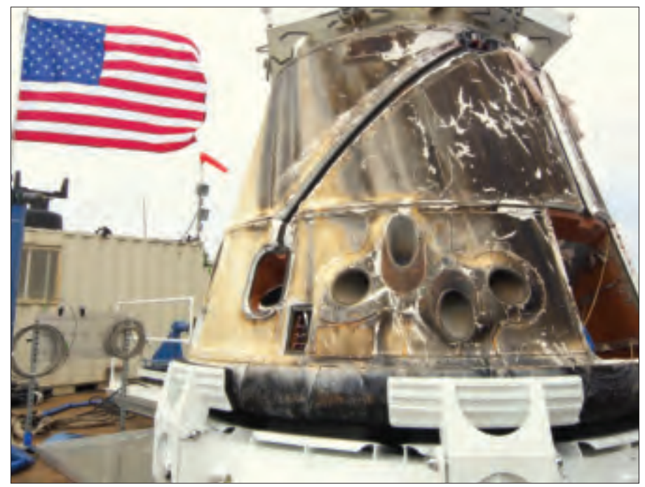
Dragon rests on the barge after being retrieved from the Pacific Ocean after splashdown.

A NASA airborne camera finally caught Dragon's infrared glow. When three parachutes billowed and slowed the spacecraft, it was all over except the rapid-fire popping of champagne corks at SpaceX headquarters in Hawthorne, California.