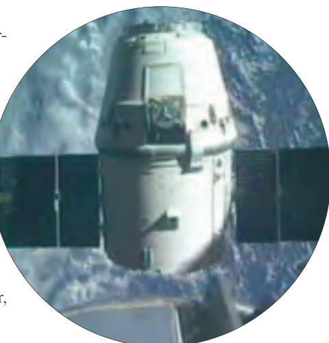
After six days at the ISS, Dragon departs for its return to Earth, carrying a load of cargo for NASA. It carries a high-tech, high-performance heat shield to protect it during the return through the atmosphere. All other cargo resupply vehicles burn up during reentry.

The $800-million COTS program, funding private development and testing milestones, is now materially closer to enabling regular cargo runs to ISS. SpaceX and NASA signed a $1.6-billion commercial resupply services contract in December 2008 for 12 flights to the station through 2015. Orbital Sciences will receive about $1.9 billion for eight cargo flights during the same interval. The flight rate is expected to be