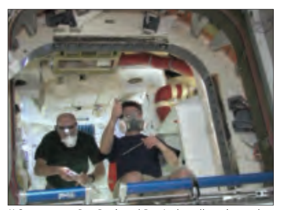
U.S. astronauts Don Pettit and Joe Acaba collect air samples from inside Dragon. As with all visiting cargo vehicles, the astronauts wear breathing and eye protection to guard against any stray material.

The spacecraft performed a series of separation burns, departing safely from ISS, then positioning itself for deorbit. The capsule closed its guidance, navigation, and control systems compartment door, fired thrusters for re-