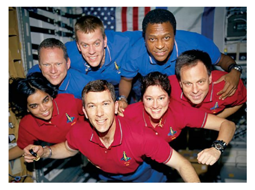
▲ This picture of the STS-107 crew posing for the traditional in-flight portrait was on a roll of unprocessed film recovered from the orbiter debris.