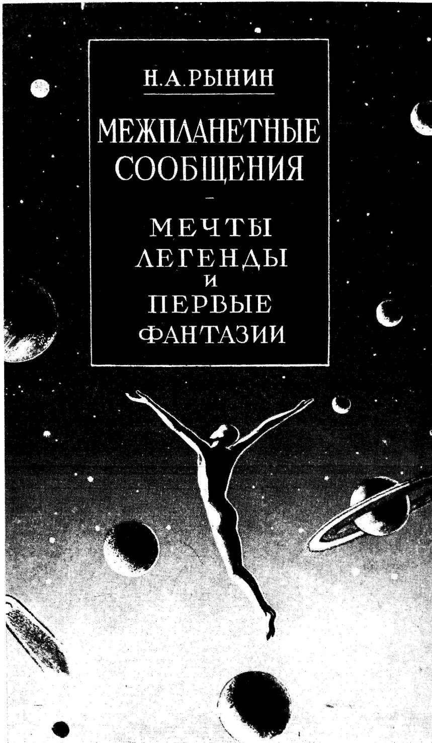
Fig. 3. Title page, N. A. Rynin's Interplanetary Flight , Vol. I, No. 1, Dreams, Legends, and Early Fantasies , Leningrad (1928).

own valuable and interesting researches in the field of rocket propulsion and the history of interplanetary travel.' Rynin was particularly indebted to Tsiolkovsky, the patriarch of cosmonautics in the USSR. Tsiolkovsky's letter of June 11, 1926 in which he