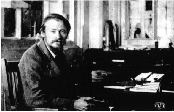
Figure 10–10: Fridrikh Tsander.

problem of mass ratio (the need to have a rocket that is up to 90 percent propellants by weight at liftoff). He wrote a number of other manuscripts on theories of spaceflight, but these were not published in the USSR until after his death in 1933. In the last years of his life Tsander also played a key role in launching liquid-propellant rocketry in his country. 31