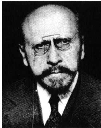
Figure 10–7: Hermann Ganswindt. Credit: Smithsonian National Air and Space Museum (NASM 83-2819).

l'espace ( The Conquest of Space ) was not only non-mathematical and scientifically flawed; it also was apparently unread. 26 At the beginning of 1920 came Goddard's work and in mid-1923, Oberth's, with the effects already described. Walter Hohmann's Die Erreichbarkeit der Himmelskörper ( The Attainability of the Heavenly Bodies ) appeared in 1925, followed by a long list of theorists emboldened primarily by Oberth and Tsiolkovskii, notably the Austrians Guido von Pirquet and Hermann Noordung (pseudonym for Potočnik), and the Soviets Fridrikh Tsander and Yurii Kondratiuk, all of whom published in the late 1920s and early 1930s.