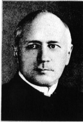
Figure 10–4: Nikolai Rynin.

By far the most comprehensive survey was by Rynin, who issued a pioneering nine-volume encyclopedia, Mezhplanetnye sooshchenia (Interplanetary Flight and Communications) , between 1928 and 1932. In his early volumes he comprehensively chronicles every idea and concept for space travel (and also for advanced atmospheric flight and long-range missiles) in nonfiction and fiction—a valuable compendium that includes many long-forgotten and mostly wrong or half-baked ideas. Only in the later volumes does he clearly assign credit. He devotes all of volume 7 to Tsiolkovskii (including the reprint of many of his works), and volume 8 to (in this order): Esnault-Pelterie, Goddard, Oberth, Hohmann, the German spaceflight skeptic Hans Lorenz, and then a dozen others more briefly. Earlier in the series, in volume 4, Rynin makes clear that his fundamental list was five, not three, that is, including Esnault-Pelterie and Hohmann. 8