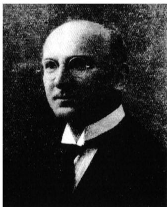
Figure 10–8: Walter Hohmann.

were possible. Hohmann's most notable contributions are in celestial mechanics and in studies of reentry into Earth's atmosphere and on landing on other celestial bodies, especially his theory of interplanetary minimum-energy trajectories, sometimes called Hohmann transfer orbits in his honor. The celestial mechanics of travel to the planets was further developed by the Austrian Guido von Pirquet, who published a multipart series in the journal of the German spaceflight society in 1928–1929. One last contributor from Central Europe should be noted, the Slovenian-Austrian Herman Noordung (whose real last name was Potočnik). His Das Problem der Befahrung des Weltraums ( The Problem of Space Travel ) is fundamentally a popular work for the public, but is noteworthy for developing the idea of a space station much more than in earlier works, as well as for his choice of geostationary orbit. 30