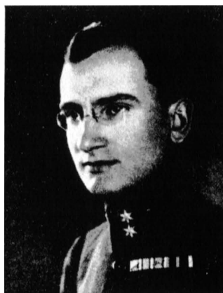
Figure 10–9: Herman Noordung.

Finally, two more Soviet theorists made significant contributions: Fridrikh Tsander and Yurii Kondratiuk, both of whom started long before they had heard of Tsiolkovskii, in 1908 and 1916 respectively. Tsander, a Latvian of Baltic German background, published his first work in 1924 and his book finally, after years of delay due to financial problems and bureaucratic inertia in the state-owned publishing house, in 1932. There is much that is original and interesting in Tsander's work, but he was obsessed with an idea that seems, in hindsight, completely impractical from engineering considerations: a space plane that would ascend to the upper atmosphere with air-breathing propulsion, then melt down large parts of its structure and burn them as propellant, thereby reducing the