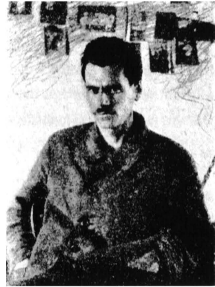
Figure 10–11: Yurii Kondratyuk.