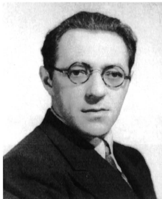
Figure 10–5: Willy Ley.