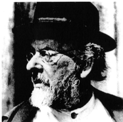
Figure 10–6: Konstantin Tsiolkovskii.

Meanwhile, Soviets had begun to put Tsiolkovskii on a pedestal again under the influence of a Stalinist nationalism that attributed all-important inventions to Russians. At the end of his life, between 1932 and 1935, Tsiolkovskii was hailed as a Soviet hero of aeronautics and rocketry—he had spent more time and effort advocating the metal airship during his lifetime than he ever had on rockets. But during World War II, his name sank back into relative obscurity. After 1946–1947, as Asif Siddiqi has recently demonstrated in The Red Rocket's Glare , leading rocket engineers around Sergei Korolev strategically revived Tsiolkovskii's reputation primarily as a space pioneer in order to build a foundation for future Soviet spaceflight projects just as their ballistic missile program was accelerating based on captured German technology. This led to an outpouring of Soviet literature on Tsiolkovskii in the 1950s that asserted his priority as the first and most important space theoretician in the world. 13