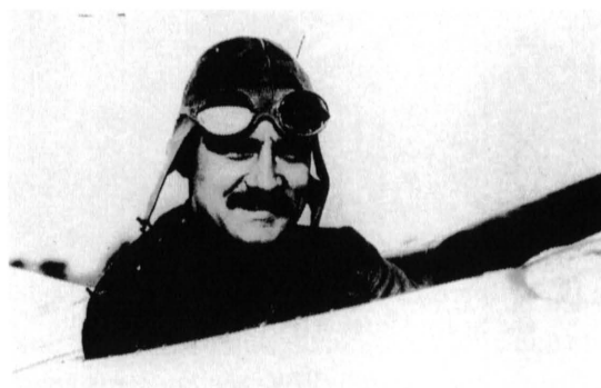
4- REF at the controls of the "REF-2 monoplane".