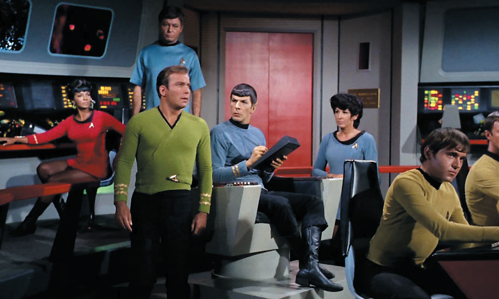
The original crew of the USS Enterprise .