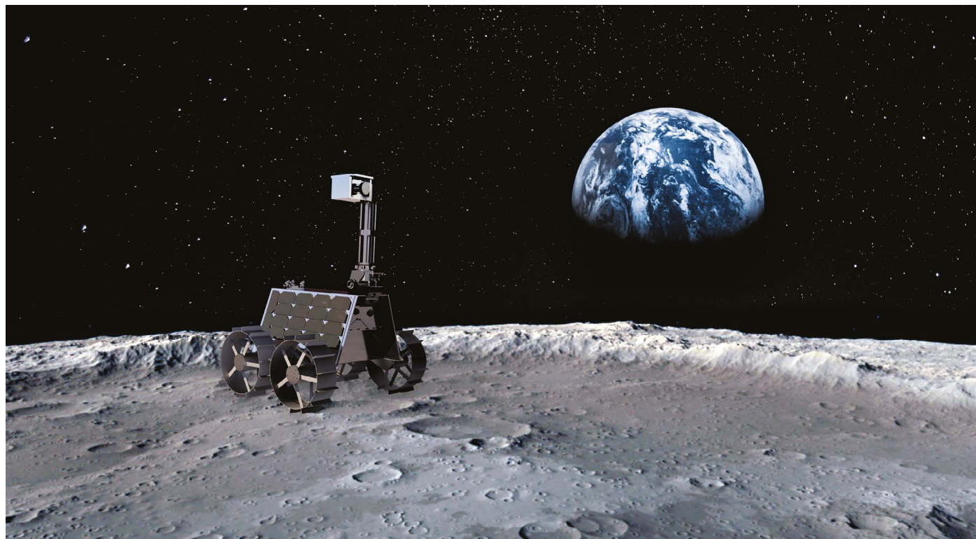
An artist's impression of Rashid, the UAE's lunar rover, which will include high-resolution cameras, a thermal imager and a Langmuir probe.