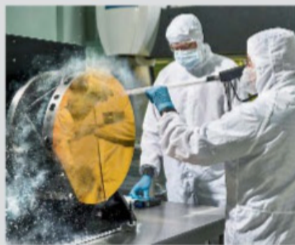
Decades in the making, NASA's new space telescope should produce some surprises

Whenever a new instrument opens a fresh observational window, it creates a universe of possibilities, says Freedman. The JWST is no exception. "Almost every field of astronomy is going to learn new things," she says. "Then there are going to be the discoveries that nobody anticipates at all, and those are sometimes the most fun."