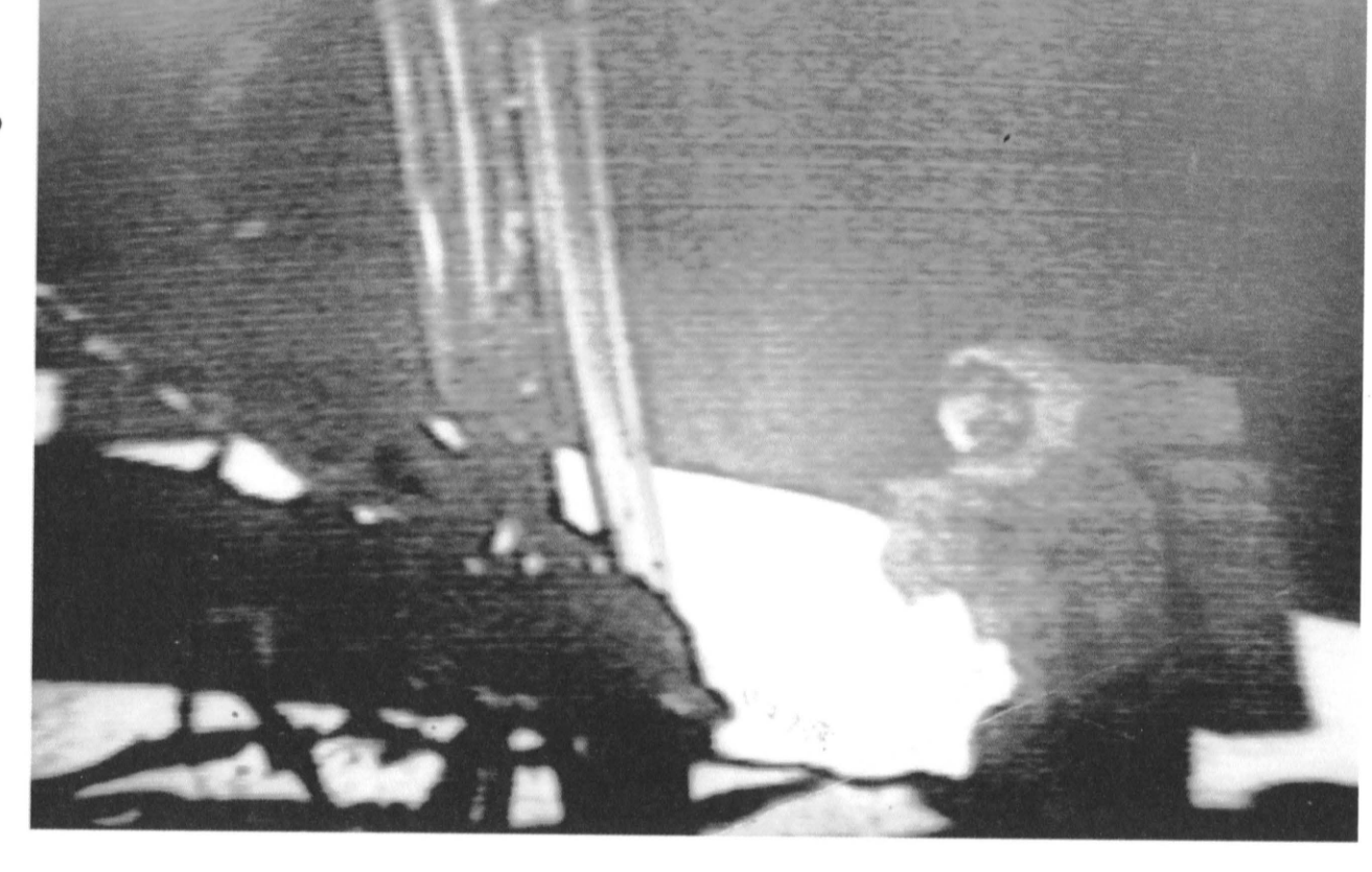
Neil A. Armstrong moves away from the leg of the landing craft after taking the first step on the surface of the moon