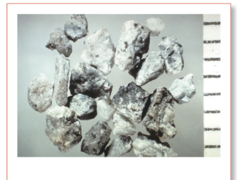
▲ SURPRISE DISCOVERY Pieces of the white igneous rock anorthosite puzzled the team when discovered in the samples. Scale is in millimeters.

This find puzzled us. It is not enough for scientists to describe things; the whole point is to understand them. First, where had the light-colored anorthositic particles come from? That question was not so hard to answer. The Apollo lander Eagle had set down on the edge of the dark, basalt-filled Mare Tranquillitatis, only about 50 km from the beginning of the whiter lunar highlands, called terrae. Impacts on the terra regolith surely would have scattered some of it over into the mare regolith. This must have been the source