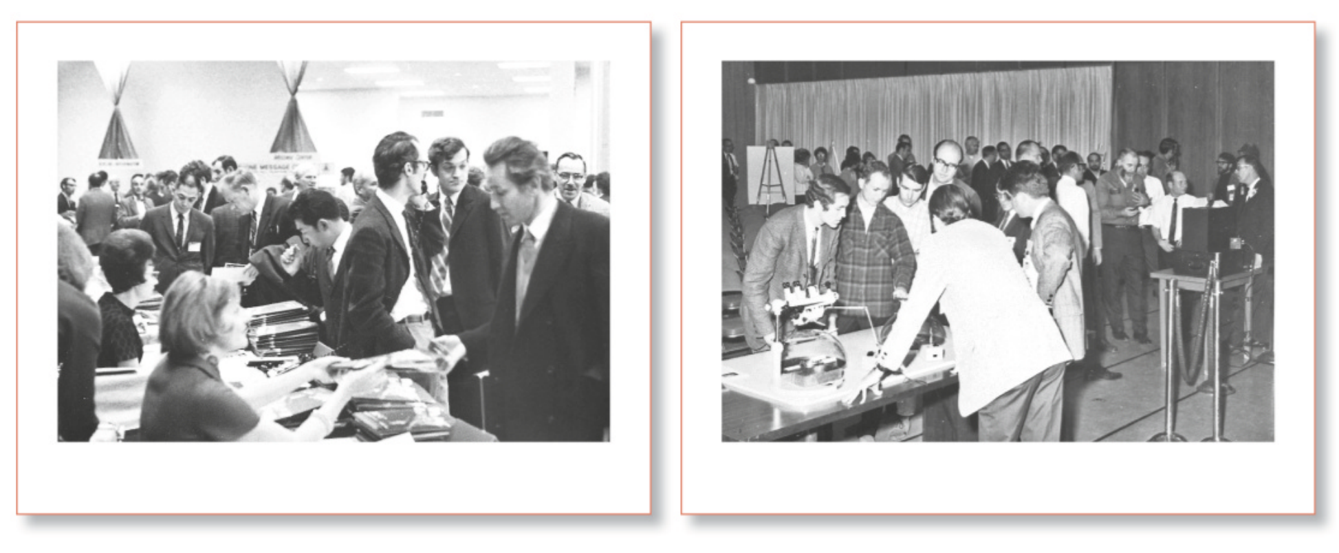
▲ THE CONFERENCE Attendees collect materials (left) and people study samples (right) at the Apollo 11 Lunar Science Conference in Houston. The meeting was the first of what would become the annual Lunar and Planetary Science Conference, which meets every spring in The Woodlands, Texas.

brought home Earth's fragility to its inhabitants and inspired them to take better care of their home.