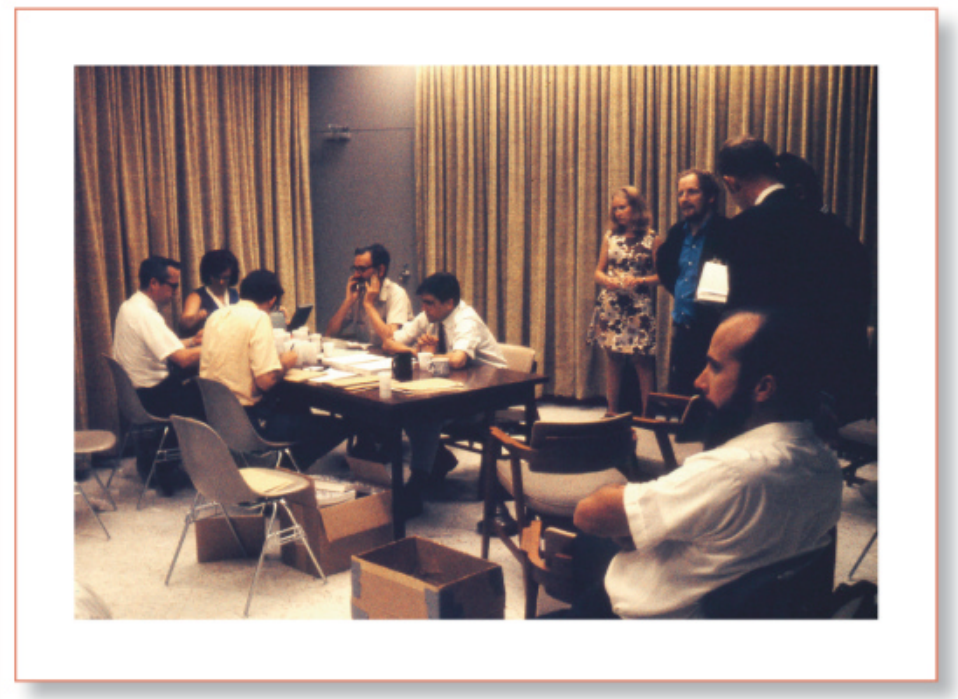
▲ SIGN HERE PLEASE Upon arrival in the Lunar Receiving Laboratory in Houston, scientists were met with a table of paperwork along with their samples.

At last I received two polyethylene cylinders, each about five inches tall, containing my group's lunar samples. Opening these, I found packing material and two much smaller plastic vials, labeled 10085,24 and 10084,108. The first contained 11 grams of coarse lunar fines, larger than 1 millimeter in size and mostly smaller than 2 mm. The second held 5 grams of "fine fines," particles smaller than 1 mm in diameter. The LRL curatorial staff had sieved the bulk soil sample collected by the astronauts into these fractions. With NASA's concerns about security fresh in my mind, I borrowed a needle and thread from one of the secretaries in the room