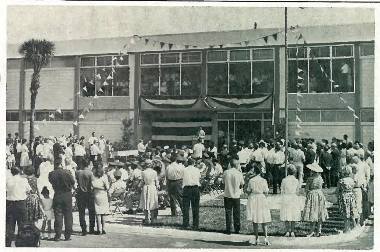
A LARGE CROWD gathered on Merritt Island last week to witness dedication ceremonies at the new Corps of Engineers Building, just south of the Barge Canal. The handsome, two-story building houses all Canaveral District Corps members.