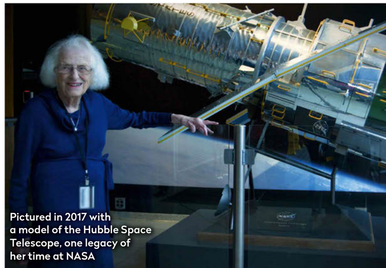
Pictured in 2017 with a model of the Hubble Space Telescope, one legacy of her time at NASA

many of her colleagues advocated for NASA to build a large space telescope, she dismissed the plans as premature, instead electing to fund a series of smaller satellite observatories.