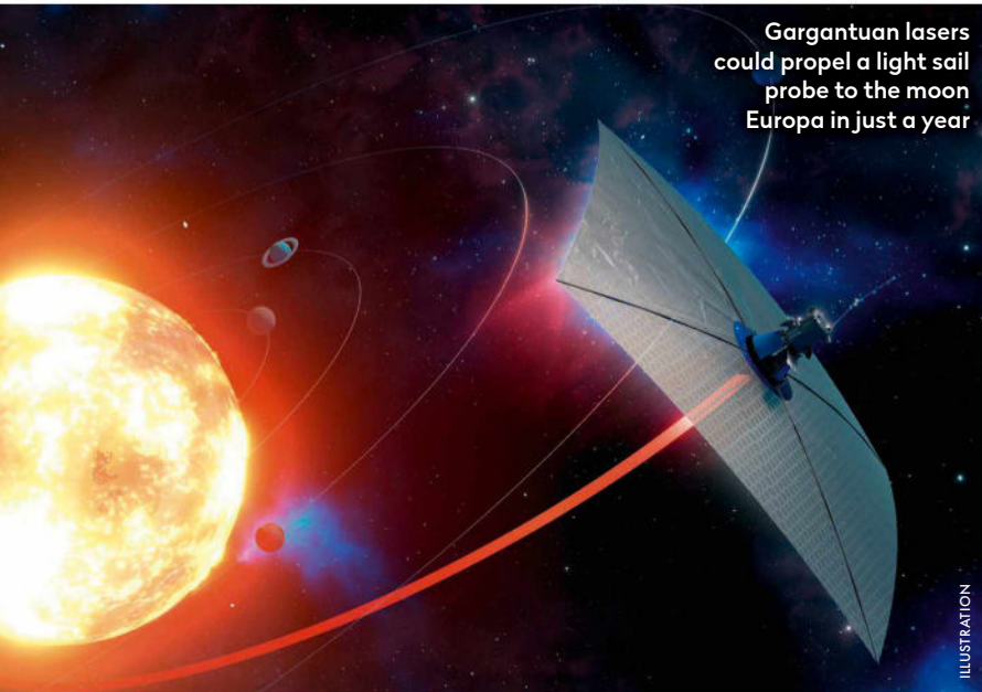
Gargantuan lasers could propel a light sail probe to the moon Europa in just a year