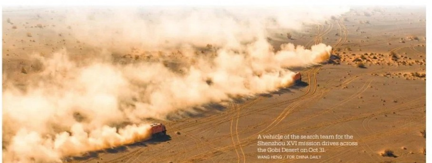
A vehicle of the search team for the Shenzhou XVI mission drives across the Gobi Desert on Oct 31.