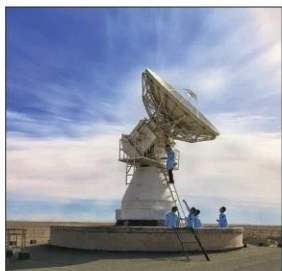
Technicians double check measurements and control equipment on May 27, 2022, before the Shenzhou XIV mission.

The return capsule of the Shenzhou XV manned spaceship is loaded on a truck to leave the desert on June 5.