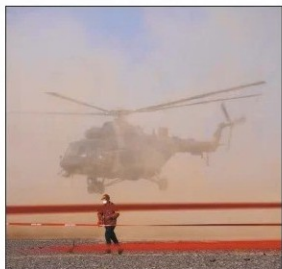
A search and rescue team member works at the landing site after the return capsule of the Shenzhou XV manned spaceship successfully lands on June 4.