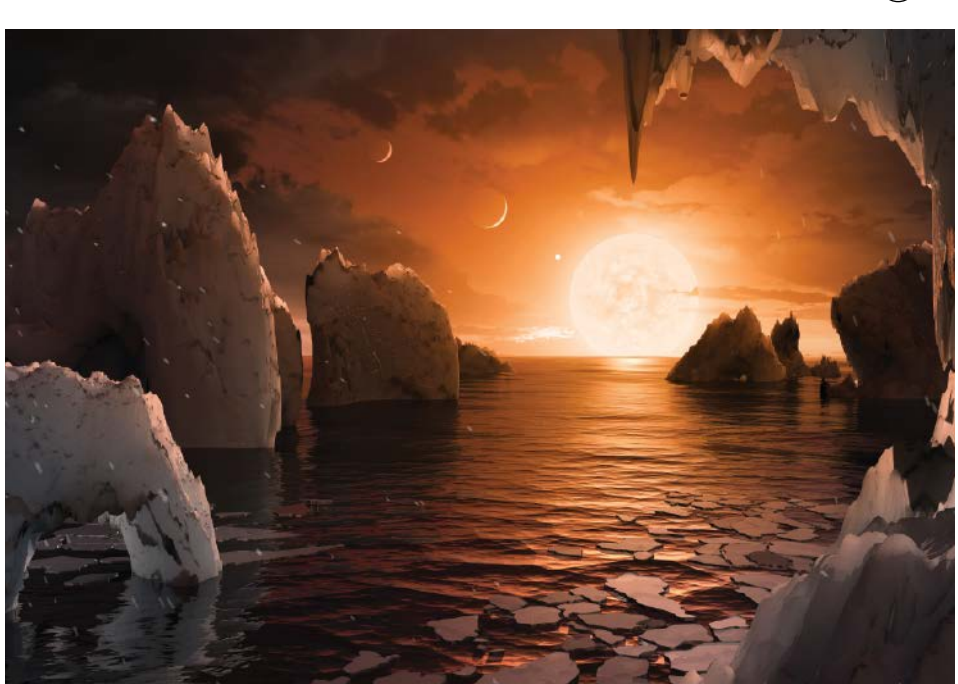
An artist's representation of a view from the surface of one of TRAPPIST-1's planets. In late February researchers announced that they had discovered seven exoplanets, all within the temperate zone of their parent star, where liquid water could exist and perhaps foster conditions for extraterrestrial life.

orty light years away, seven Earth-sized ■ planets circle a small, dim, "ultracool"