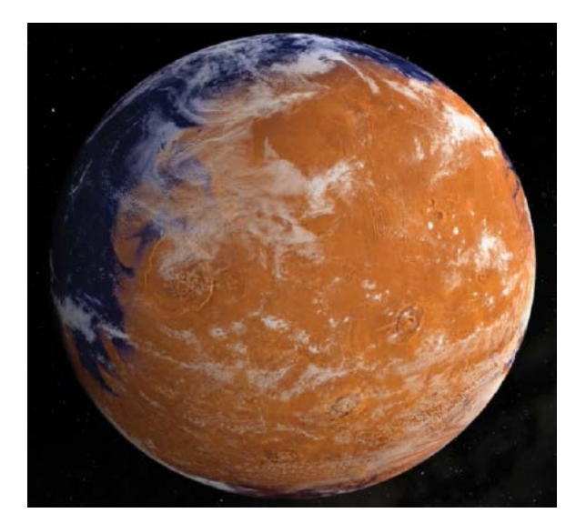
This artist's conception, based on Mars's current topography, shows an early, wetter Mars with a thicker atmosphere.

To help communicate these key concepts and share the story of Mars's changing climate, MAVEN's public engagement team has worked out a variety of tips and resources.