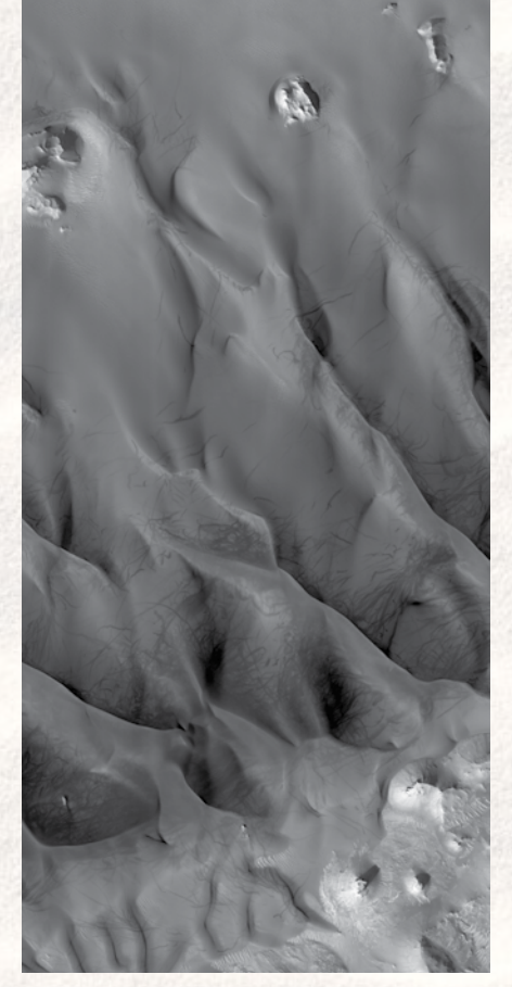
Dune fields exist on many bodies in our solar system, including on Mars, as seen in this image taken by HiRISE.

Mars has a much thinner atmosphere than Earth, and so provides an opportunity to study atmospheric conditions and aeolian processes intermediate between those on Earth and on bodies that lack atmospheres, like comets and Pluto. In addition, because Mars appears substantially more hospitable