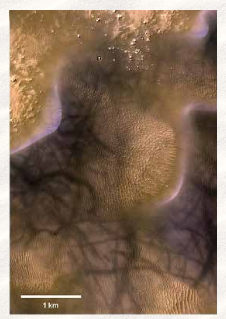
Dust devil tracks have removed dust from dark dunes on Mars in this HiRISE image.

munity has recognized the need to do so, and archiving policies are being modernized (e.g., requiring better metadata and metadata controls) to increase data searchability, accessibility, and usability. However, model outputs still are rarely considered data and often are not archived, in part because these outputs can be superseded rapidly as models are upgraded and model outputs are continually improved, making decisions of what should be saved and stored difficult. For example, should an output data set be archived every time an input parameter is tweaked and the model is rerun? If improvements are made to the model and all of the previous runs are redone, should all of those data be archived as well? If only selected outputs are saved, what standards (besides limitations on data storage space)