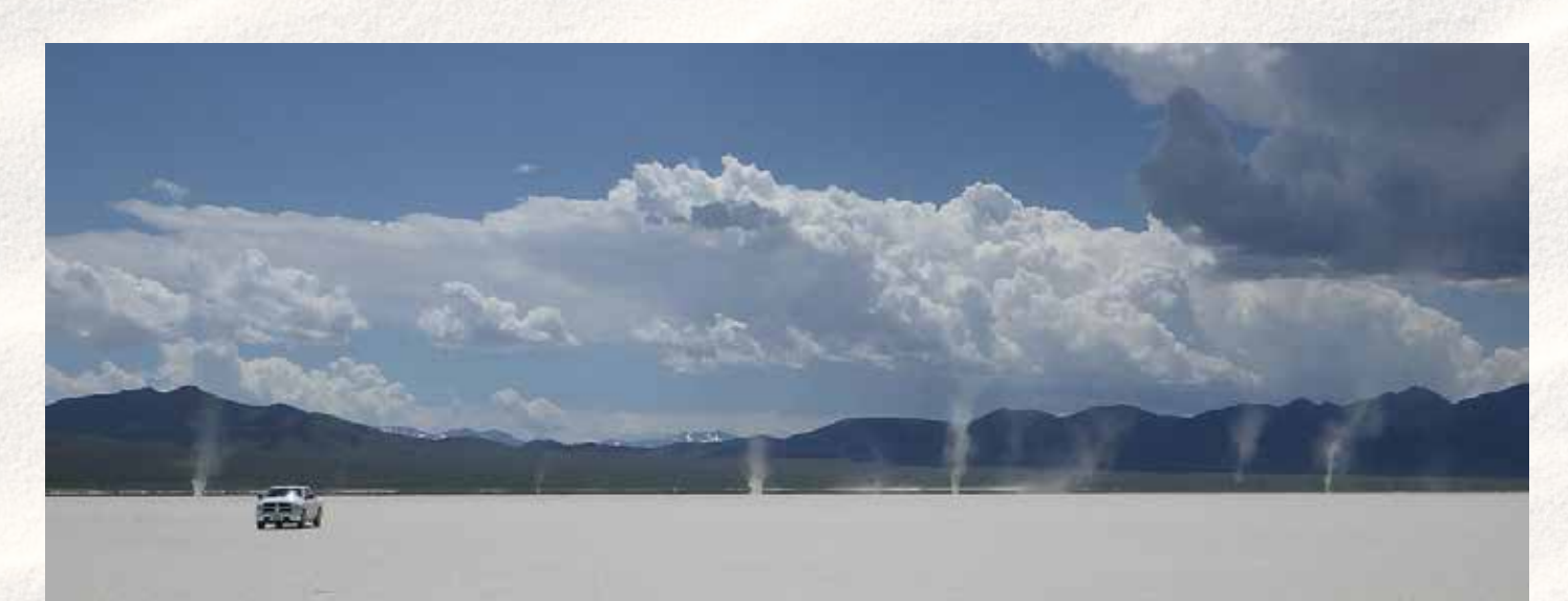
An analogue field study shows dust devils at Smith Creek Valley in Nevada.

Powered flight enables detailed investigations of expansive, hard-to-reach dune fields on Earth, and the same would be true