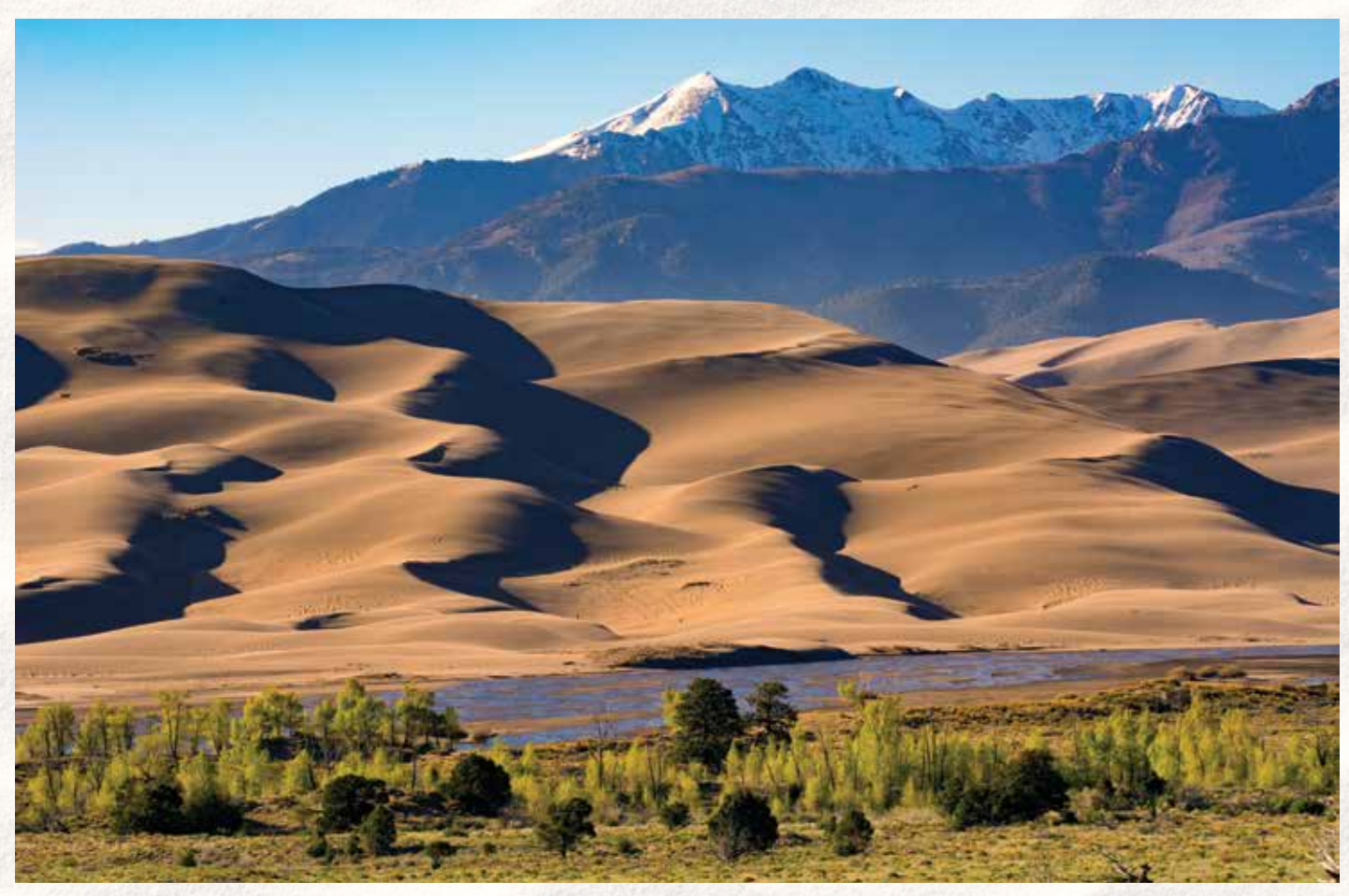
Aeolian dunes spread out against a background of rugged mountains in Colorado's Great Sand Dunes National Park and Preserve.

on other worlds. The successful flights of Ingenuity on Mars beginning in 2021, marking the advent of powered flight on another planet, may represent a defining moment in enhanced planetary dune exploration and science. Even though Ingenuity is primarily a technology demonstration, it has already conducted aerial reconnaissance for the Perseverance rover.