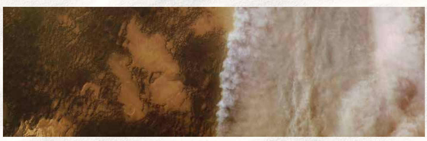
A dust storm encroaches on dark north polar barchan dunes on Mars.

pension and can be transported far from its origin. Sand is heavy enough that it either rolls along the ground or readily falls back to the surface after being lofted by winds, perhaps kicking up additional grains of sand and dust in a process called saltation. Saltating grains launch dust off the surface to form the atmospheric dust load (see sidebar), they abrade planetary surfaces to expose buried rock records, and they build bedforms that record wind patterns. Indeed, most aeolian landforms are associated with saltation.