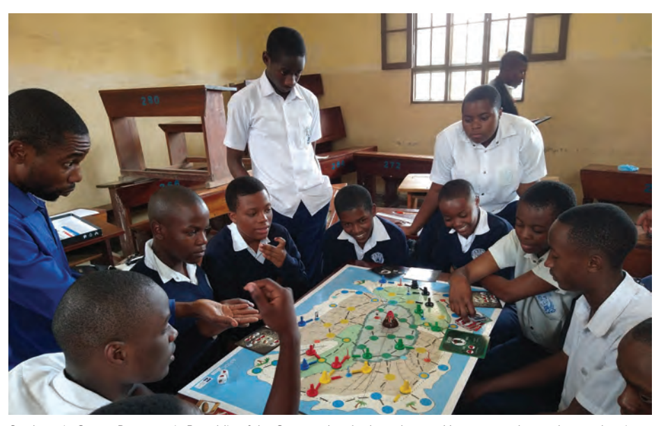
Students in Goma, Democratic Republic of the Congo, play the board game Hazagora to learn about volcanic hazard resilience.

emories of the glow emanating from the top of the Democratic Republic of the Congo's Mount Nyiragongo volcano have not been forgotten by those living nearby. At the volcano's summit is a lava lake that lights up the night sky like a beacon. In May 2021, an unexpected lava flow came down Nyiragongo's flank, pouring into the outskirts of the nearby Congolese city of Goma as residents fled in the dark.