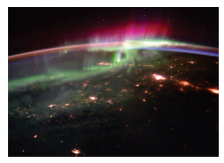
Stunning aurorae, or northern and southern lights, are caused by solar winds interacting with Earth's magnetic field. These interactions can also trigger vibrations that with the right tools can be amplified for us to hear.

Since that discovery, with the backing of NASA, the HARP team has worked with