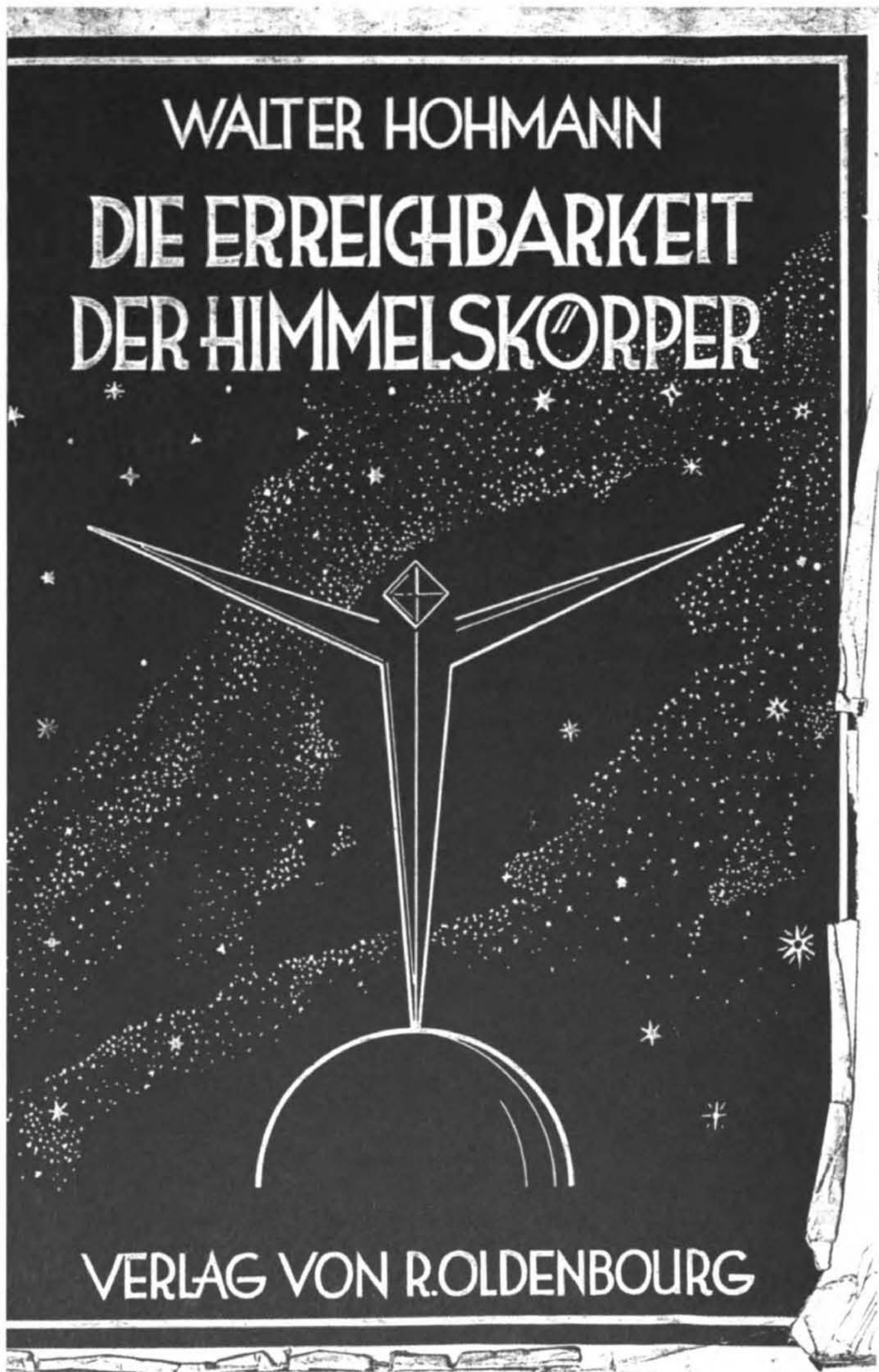
Figure 1. The design of the cover for this 1925 book exemplifies modernist culture within the Weimar Republic. The paper cover is approximately 17.6 cm × 25.4 cm, with white figures on a dark blue background