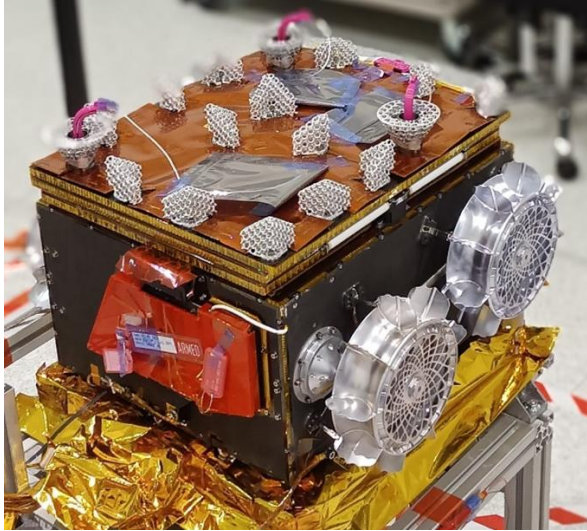
Figure 2 Rover Flight model in cruise configuration

Mission Status: The qualified IDEFIX Rover has been delivered from Europe to Japan in early 2024. It will be integrated into the main spacecraft and will undergo further tests on spacecraft level. The current MMX schedule has a launch date in JFY 2026, followed by Martian orbit insertion in JFY 2027 and the