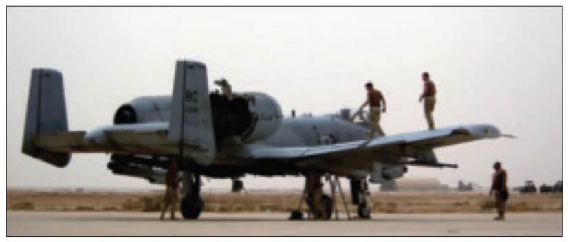
During Operation Iraqi Freedom, A-10 maintenance members from the 392 Air Expeditionary Wing inspect their aircraft for any additional damage after it was hit by an Iraqi missile in the right engine. The A-10 made it back to the base safely.

relatively new discipline could contribute to the needed improvement in the naturally hostile space environment.