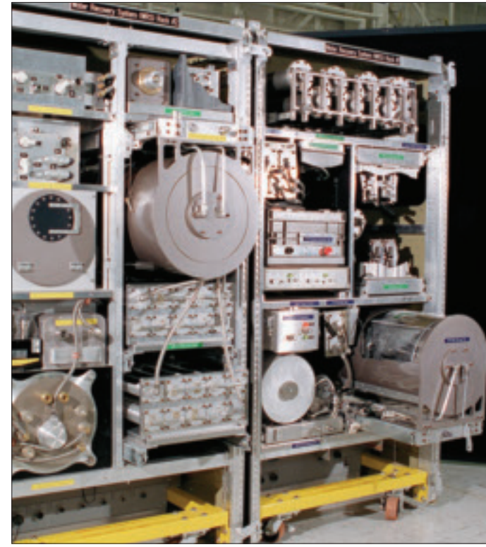
The WRS provides clean water through the reclamation of waste waters.

Turning to the future of human spaceflight, Roman foresees regenerative life-support systems that are a hy-