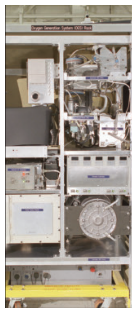
An oxygen generation system uses electricity from station solar panels to generate breathable oxygen through electrolysis.

Once the urine is fully distilled and processed, the potable water product is treated with iodine "to keep any residual microorganisms that might still be in your product water from regrowing and becoming a microbiological hazard," notes Robert Bagdigian, branch chief in NASA Marshall's Engi-