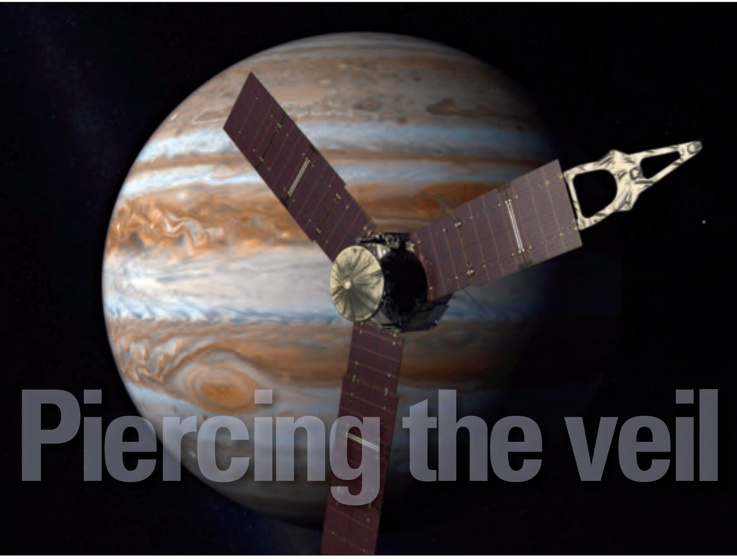
Juno will explore Jupiter starting in 2016 from an elliptical, polar orbit.

lowing Pluto New Horizons, a probe now en route to a 2015 flyby of Pluto and its moon Charon. JPL in Pasadena, California, manages Juno's mission; the spacecraft was built by Lockheed Martin Space Systems.