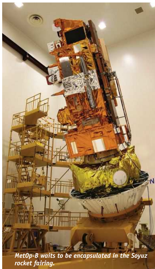
MetOp-B waits to be encapsulated in the Soyuz rocket fairing.

Now looms a dangerous threat to the quality of weather forecasting and of life on