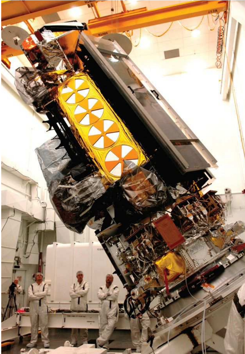
Forecasts fostered by POES are used by the farming, energy, transportation, fishing, and tourism sectors.

provide high-confidence forecasts 2-7 days ahead. It has been estimated that timely forecasts fostered by the POES satellites alone are worth up to $8 billion a year to the farming, energy, transportation, fishing, and tourism sectors of the U.S. economy.