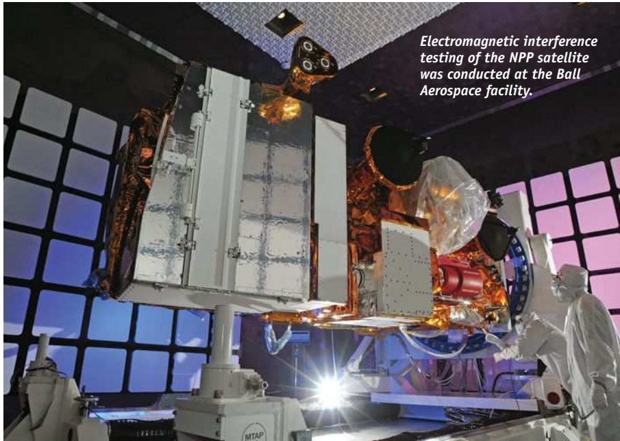
Electromagnetic interference testing of the NPP satellite was conducted at the Ball Aerospace facility.

to cease functioning in October 2016. Having reviewed NOAA satellite programs, the General Accountability Office predicted a gap in Earth observational coverage of 17-53 months from the end of Suomi service to the operational onset of JPSS-1.