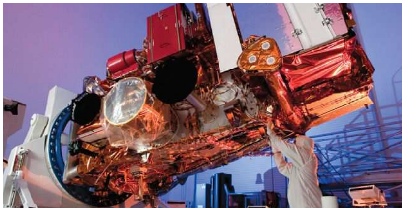
CrIS provides input for numerical weather prediction models.

The SATTF report recommended that NOAA consider adopting a “distributed systems architecture” for future Earth observing satellites that would feature single-purpose instruments on many smaller satellites instead of multipurpose instruments consolidated on larger and fewer satellites, the current approach.