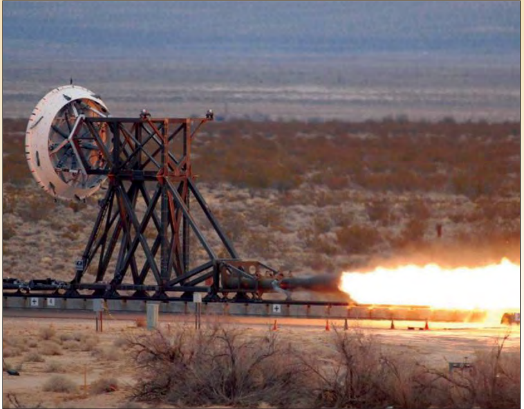
Rocket power: A deceleration device on a rocket sled test fixture at China Lake, Calif. NASA wants to go to the stratosphere next.