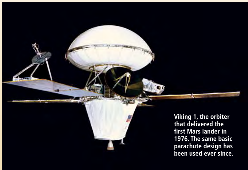
Viking 1, the orbiter that delivered the first Mars lander in 1976. The same basic parachute design has been used ever since.