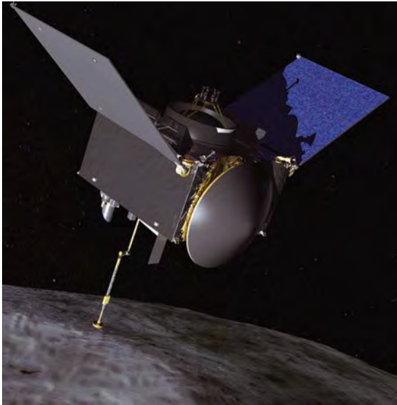
OSIRIS-REx, shown in an artist's rendering, will extend an arm to collect up to 2 kilograms of regolith from the near-Earth asteroid Bennu and return the sample to Earth.

ter-rich mantle have resurfaced parts of Ceres?”