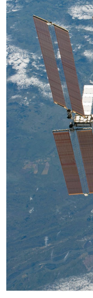
▲ The International Space Station has been maneuvered nearly three dozen times since 1999 to avoid space debris, though the station has not avoided small impacts. The photo at right of a window in the Zvezda Service Module was taken in 2007.

Space, especially low-Earth orbit, has become a complicated place since 1957, and it is becoming more so at an accelerating pace. Some 8,900 active satellites orbit Earth, most of them in LEO, where ISS and China's space station orbit. They do so among an estimated 35,000 pieces of tracked debris ranging in size from 10-centimeter-long metal fragments to entire satellites, old rocket motors and discarded rocket stages and fuel tanks. Satellite operators regularly have to decide whether to expend precious propellant to maneuver out of the way. And the numbers are only projected to grow as megaconstellation operators add more satellites. SpaceX's Starlink constellation alone numbers some 4,800 satellites and is growing, with near-weekly launches of between 20 and 50 satellites.