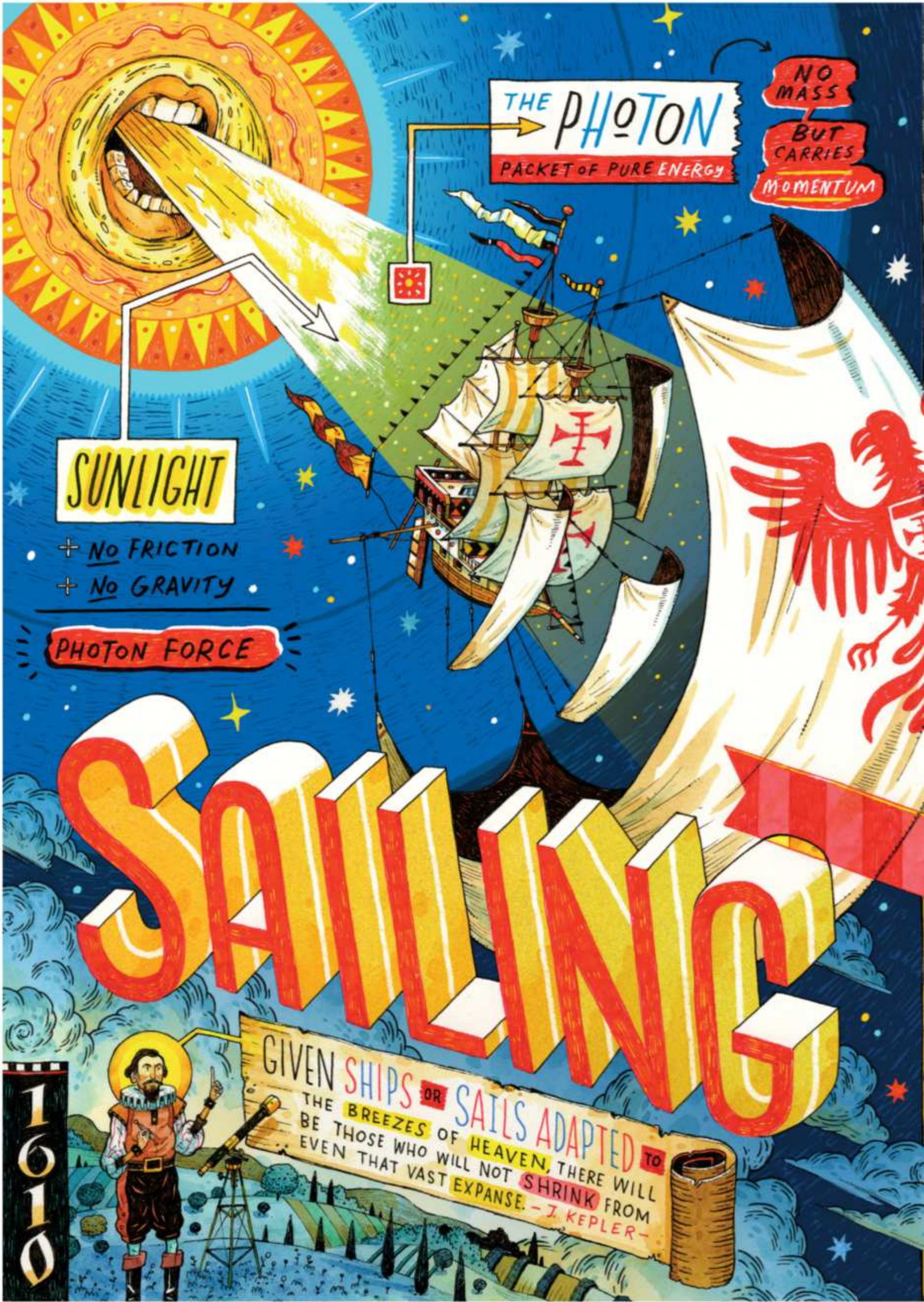
ILLUSTRATION: JOHN HENDRIX