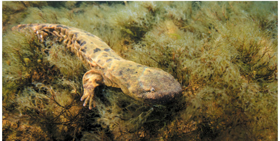
An eastern hellbender swims in the Hiwassee River in Tennessee.