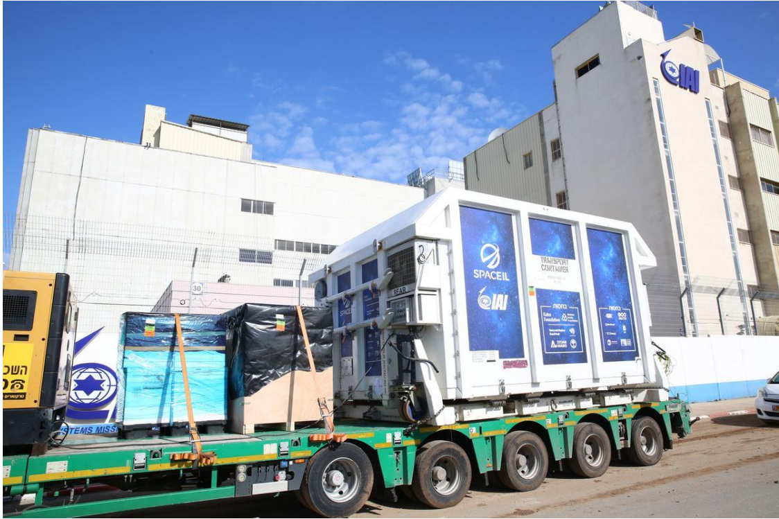
On Jan. 17, Beresheet was driven from IAI's Space Division facilities to Ben Gurion Airport, where it was packed into a cargo plane.