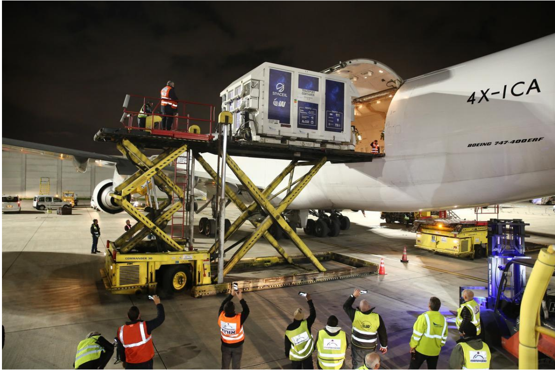
After landing at Orlando International Airport, the spacecraft will then be driven to Cape Canaveral Air Force Station in Florida.