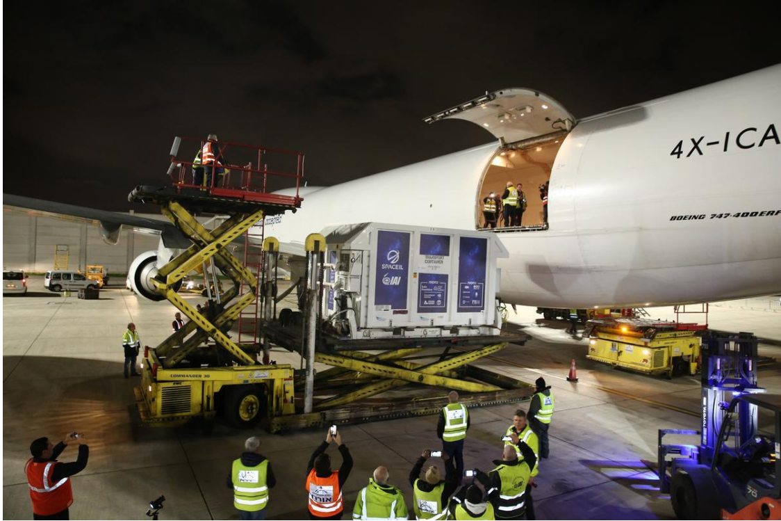
The spacecraft, inside a temperature-controlled shipping container, was loaded into a cargo plane at Ben Gurion Airport and then flown to Florida.