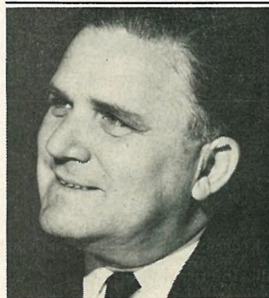
James E. Webb

"We have done what we set out to do. The question was (See PERFECT, Page 3)